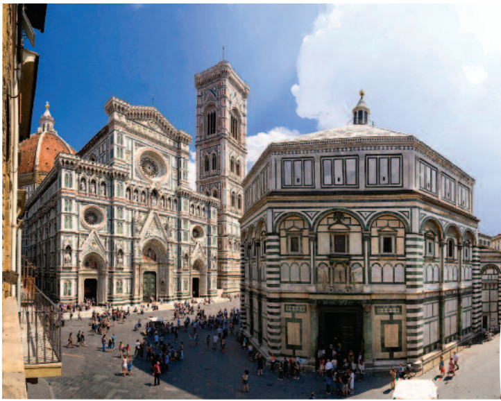
Basilica di Santa Maria del Fiore and the Baptistry