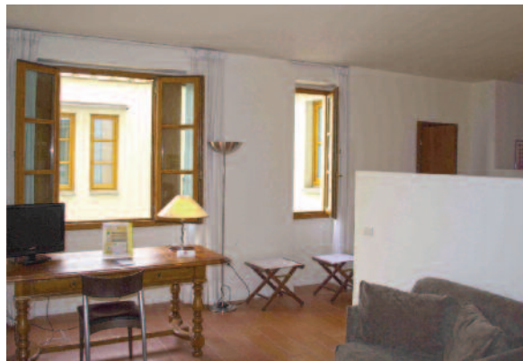
Hotel courtyard Breakfast buffet Apartment interior