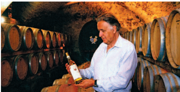
Below: Tuscan wine cellar