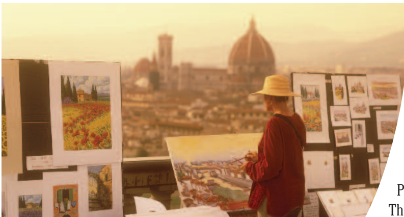
Above: Inspirational views of Florence | Below: Italian musician