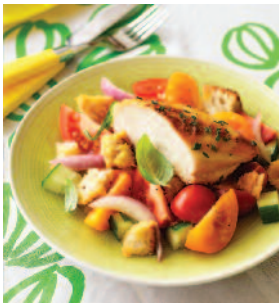
Clockwise: Tuscan specialties | Special Italian cooking demonstration | Grilled chicken on a bed of bread salad

In addition to immersing you in four full weeks of authentic Italian food, this program includes a special cooking demonstration and tasting, and optional cooking classes are available at an additional cost.