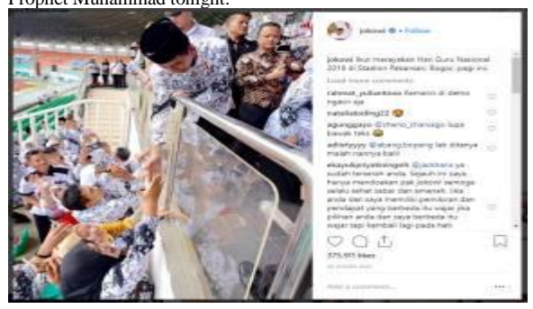
Caption: Ikut merayakanHari Guru Nasional 2018 di Stadion Pakansari, Bogor, pagiini.

Translation: Shop for batik at Setono Wholesale Market in Pekalongan, Central Java, before attending the Maulid of the Prophet Muhammad tonight.