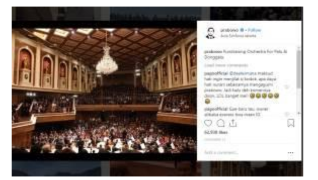
Caption: Fundraising Orchestra ForPalu&Donggala.

Caption: 1965 Yearbook, American International School of Zurich, Grade 8.