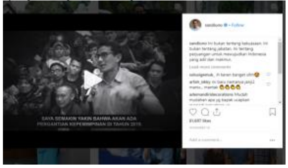
Caption: Ini bukan tentang kekuasaan. Ini bukan tentang jabatan. Ini tentang perjuangan untuk mewujudkan Indonesia yang adil dan makmur.

Translation: It was an honor for me to be invited as the 5th time speaker of the Indonesia Economic Forum (IEF). A forumattended by important figures from the government and business world.