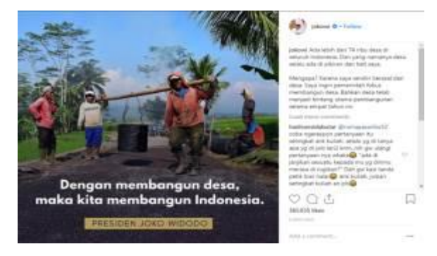
Caption: Ada lebihdari 74 ribudesa di seluruh Indonesia. Dan yang namanyadesaselaluada di pikiran dan hatisaya. Mengapa? Karena saya sendiri berasal dari desa. Saya ingin pemerintah fokus membangun desa. Bahkan desa telah menjadi bintang utama pembangunan selama empat tahun ini.

Translation: There are more than 74 thousand villages throughout Indonesia. And the name of the village is always in my mind and heart.