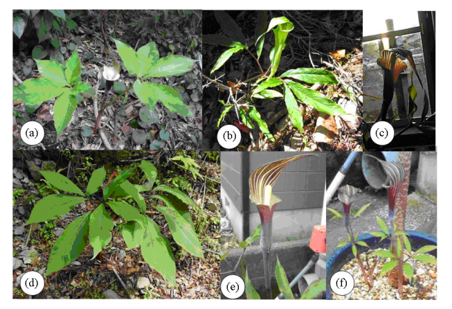
Figure 1. Arisaema species examined in this study. (a) A. sikokianum; (b) A. serratum; (c) putative hybrid in 2007; (d) putative hybrid in 2006; (e) putative hybrid in 2010; (f) newly formed putative hybrids in 2010.

ber of A. sikokianum and A. serratum is 2 n = 28 in both species [8]. Therefore, it is possible to generate a hybrid between A. sikokianum and A. serratum .