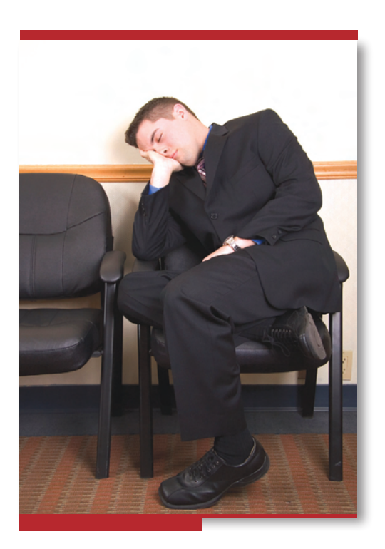
Photo 15.3 If an interviewee arrives early for an interview, is it a good idea for him or her to catch up on rest while waiting? (See page 404.)