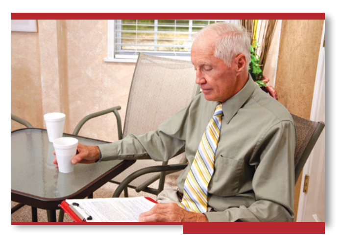
Photo 15.2 The person in this picture is reviewing application material prior to interviewing a job candidate. What are the other responsibilities of an interviewer prior to the interview? (See page 404.)

ity that may run long immediately before an interview. If multiple interviews are being conducted during a single day or period, make sure some time is scheduled between them and maintain adherence to the schedules of the interviews themselves. Ideally, there will be enough time prior to an interview to gather materials and review the application material and enough time following an interview to review your performance and evaluate the interviewee.