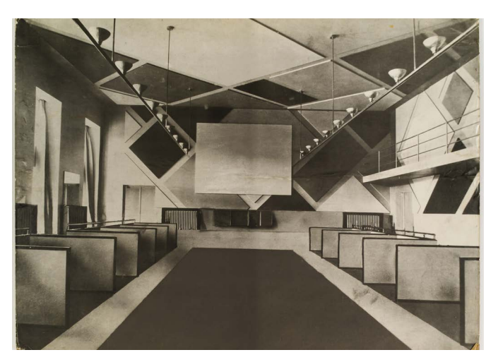
The Ciné-bal (cinema-ballroom) at Café L'Aubette, Strasbourg, designed by Theo van Doesburg, 1926-28.

including carnivals, circuses, funfairs, puppet shows and indigenous arts and crafts. Look further into these arts and entertainment forms and draw on any personal experiences of your own associated with them, to devise your own costumes, performances and artistic responses.