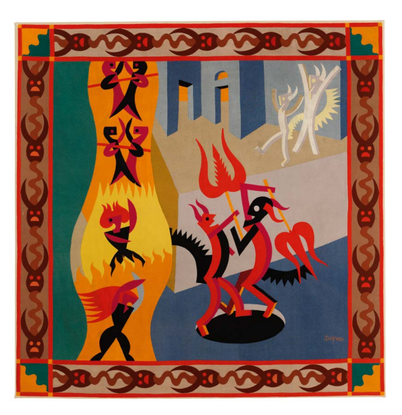
Fortunato Depero, Diavoletti neri e bianchi. Danza di diavoli (Black and White Little Devils: Dance of the Devils), 1922Mart, Museo di arte moderna e contemporanea di Trento e Rovereto / Fondo Depero © DACS 2019Archivo Depero, Rovereto.

Create your own multi-sensory and participatory spectacle blurring lines between performers and participants. Think about holding a performance in an unusual location such as outside in a park or natural area or in a tent as in the Carpa Amaro in Mexico - it could be a promenade performance, engaging directly with the audience.