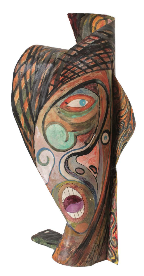
Máscara estridentista (Stridentist Mask), c. 1924. Colección Ysabel Galán, México.

Look closer at the mask as an art form and use various influences to create your own mixed media expressive masks using similar materials and techniques. Consider staging a performance dictated by the masks – what movements ensue? What emotions are evoked? How inventive and experimental can you be?