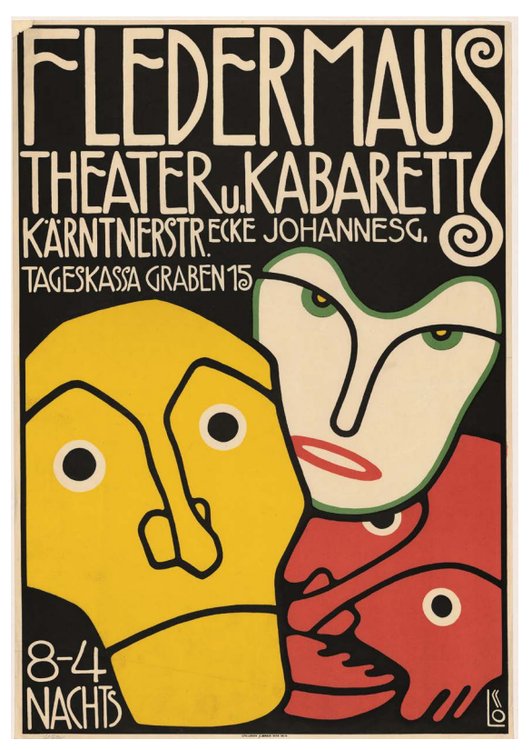
Bertold Löffler , Poster for the Cabaret Fledermaus, 1907. The Albertina Museum, Vienna

Consider how the Cabaret reflected the Wiener Werkstatte's ideals with its unique synthesis of art and design, architecture, poetry, music, performance and theatre, expressive dance and shadow plays by artist Oskar Kokoschka.