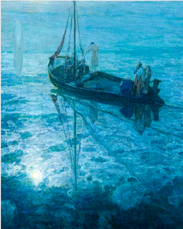
The Disciples See Christ Walking on the Water, 1907 by Henry Ossawa Tanner

FIRST CONGREGATIONAL UNITED CHURCH OF CHRIST · BOULDER