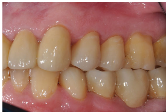
Figure 3 Clinical case with ceramic single-unit crown restorations.

The restorations in both groups were all designed and fabricated at the same dental laboratory (Dental Syd, Malmö,