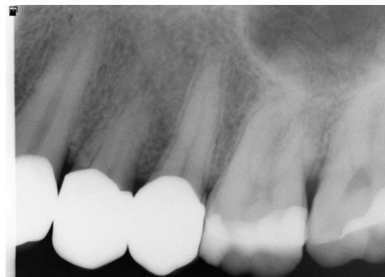
Figure 4 Radiograph of ceramic single-unit crown restorations.

Sweden) by the same dental technician using the software Dental System 2014, version 2.9.9.5 (3Shape A/S). Concerning the material used for the prosthetic restorations, 13 (6 in the conventional group, 7 in the digital group) were made of lithium disilicate (e.max; Ivoclar Vivadent AG, Schaan, Liechtenstein), 16 (7 and 9, respectively) of full zirconia (BruxZir; Glidewell Laboratories, Newport Beach, CA), and 19 (11 and 8, respectively) were metalceramic (metal part milled from a cobalt-chrome alloy). All -ceramic restorations were milled from presintered material.