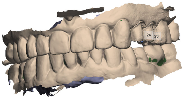
Figure 2 Buccal scan with teeth in occlusion for an interocclusal registration.

accuracy of single or fixed partial prostheses have suggested that the digital impression technique may be considered an alternative to the conventional impression technique. 8,10,12 No studies could be identified reporting on the accuracy of printed/milled models and implications of the use of such models in the fabrication of dental restorations.