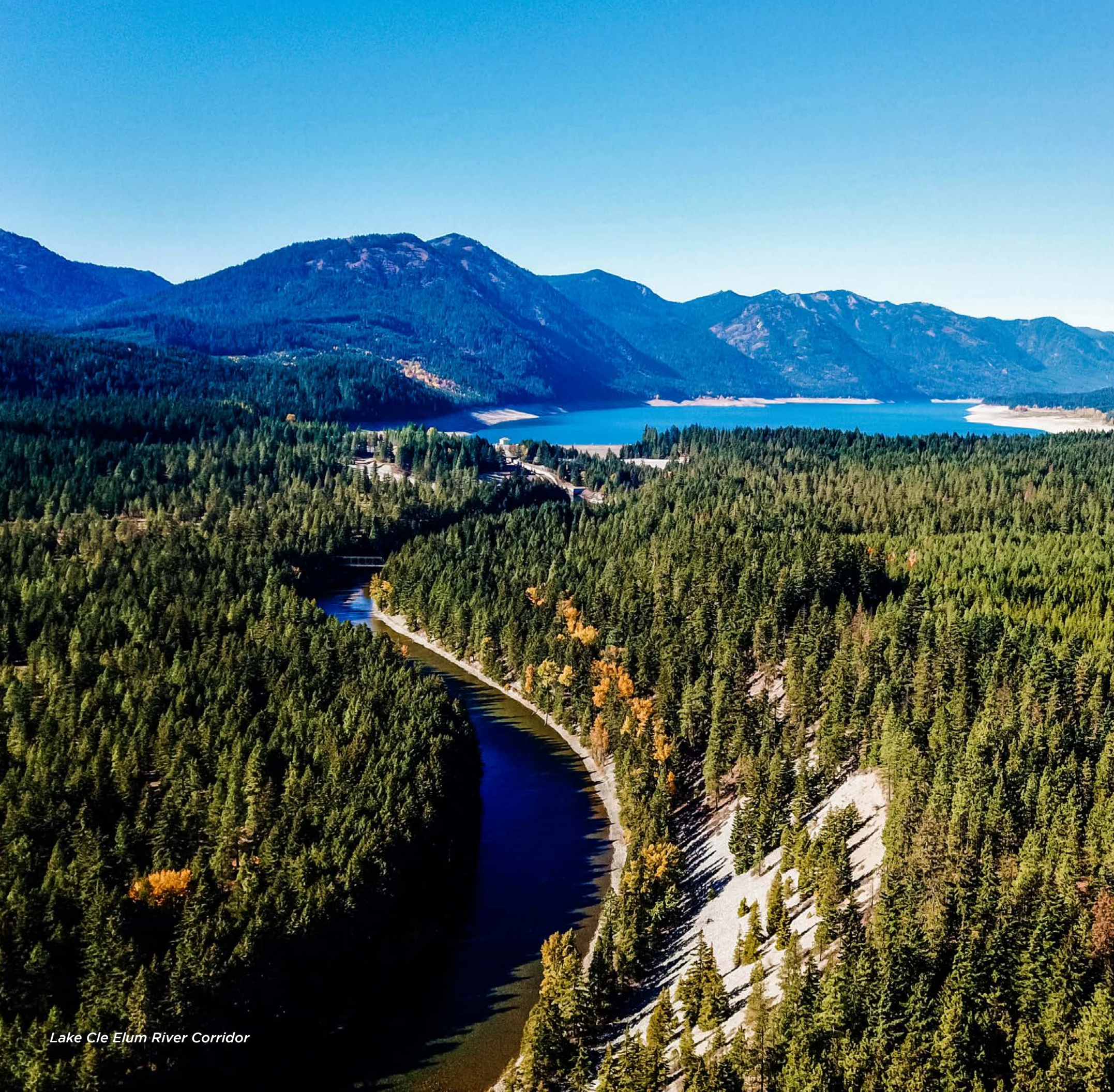
Lake Cle Elum River Corridor