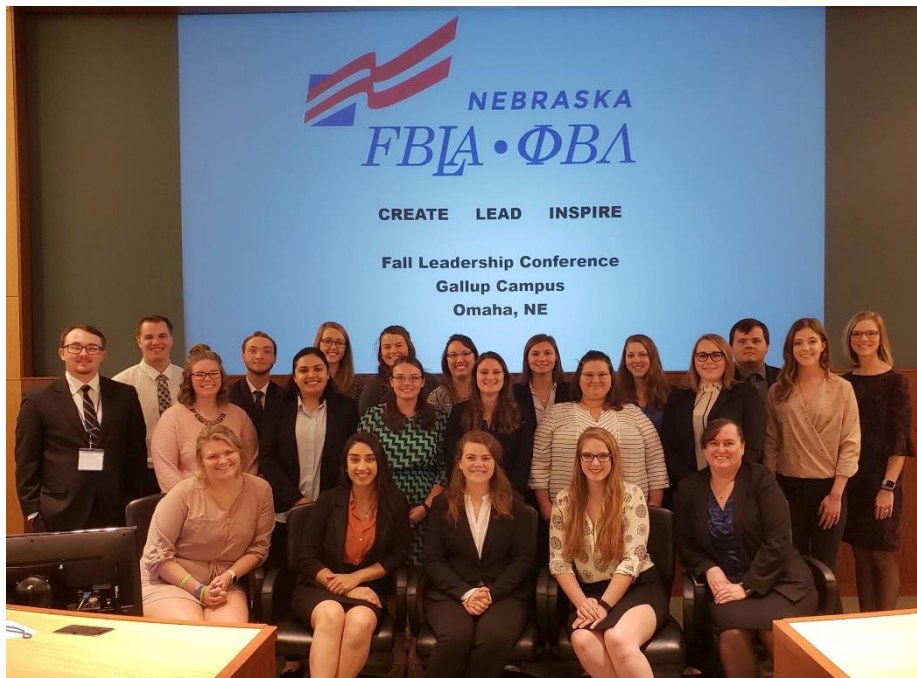
Students at the 2018 Nebraska Fall Leadership Conference

*Twenty-eight (28) students competed at the 2019 Nebraska State Leadership Conference in Kearney, Nebraska. Peru State Phi Beta Lambda was awarded seventy-one (71) placements in the Top 8, including twenty 1 st place events. Members networked with other school chapter members and participated in the annual dodgeball tournament in support for March of Dimes. Peru State Phi Beta Lambda also proudly had two members elected as state officers this year.