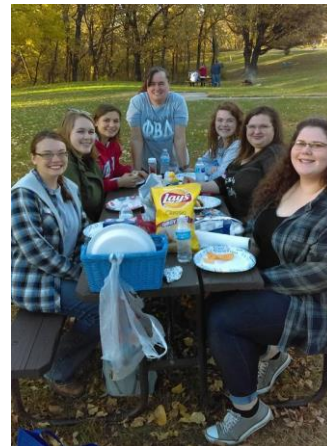
Picnic before Haunted Hayrack Ride at Indian Cave State Park