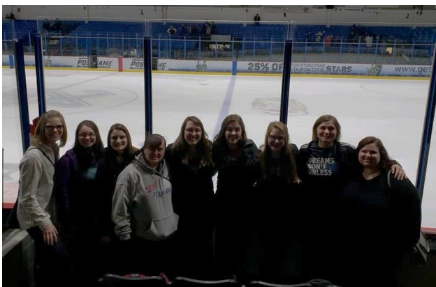
Lincoln Stars Hockey Game