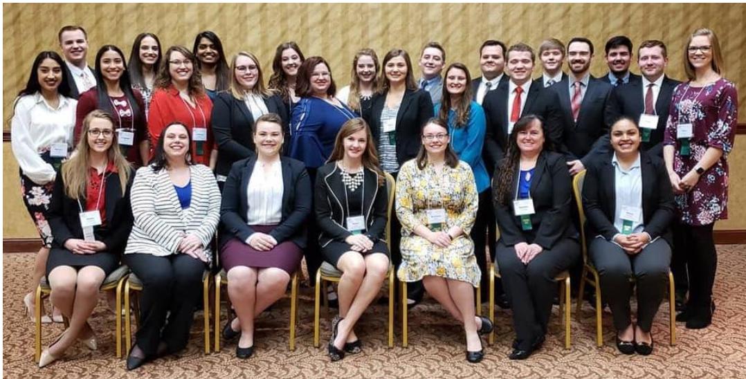
Members at the 2019 Nebraska State Leadership Conference