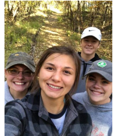
Campus of a Thousand Oaks Wellness Trail

*Donated gently used or new shoes to raise funds to purchase a bench for the Campus of a Thousand Oaks Wellness Trail