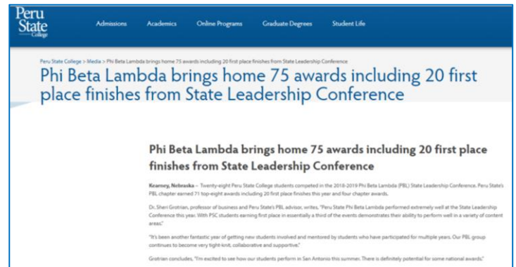
Peru State College Press Release on 2019 NE SLC