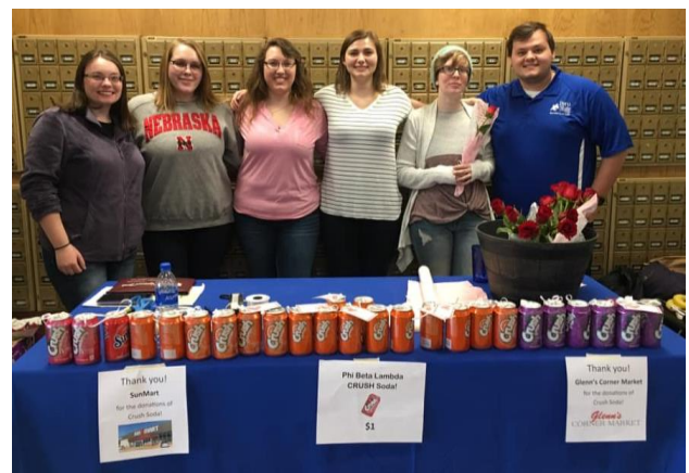
Valentine's Day Sweetheart Gifts