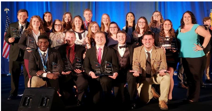
Members at the Completion of the 2018 National Leadership Conference