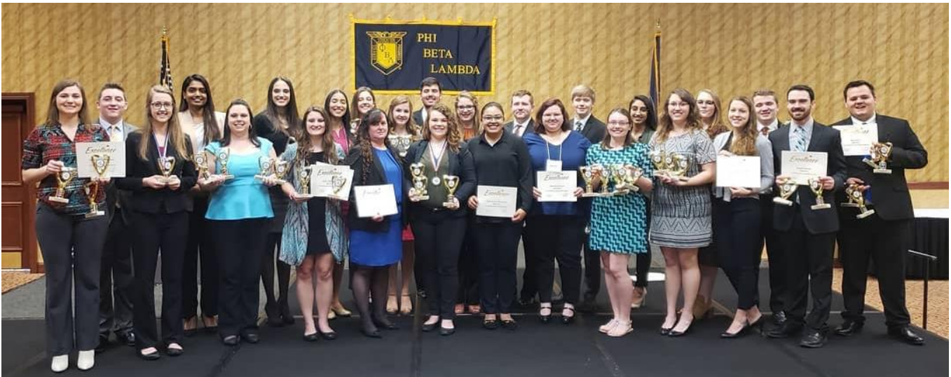
Members at the 2019 Nebraska State Leadership Conference

This report is a review from the end of the 2018 Nebraska State Leadership Conference and extends until the 2019 State Leadership Conference. It is produced by the Epsilon Tau Chapter #2725 of Phi Beta Lambda at Peru State College (PSC). With the wide array of involvement, through community service and other campus engagements that take place in our local chapter, it has allowed members to gain a greater understanding of business practices and teamwork. This report will give an overview on how a small chapter in rural southeast Nebraska can show great success, and members can walk away with a new understanding in diversity, teamwork, and leadership qualities. This report has been an eye-opening experience to the chapter and demonstrates individual and group successes.