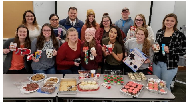
Secret Santa Exchange