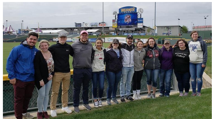
Storm Chasers Baseball Game