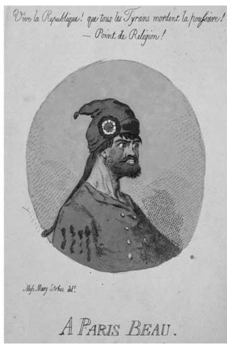
Figure 1. Sans-Culottes, as Remembered by Posterity. ( Left ) French School, The Sans-Culotte , nineteenth century, © Bibliothèque des Arts Décoratifs, Paris, France / Archives Charmet / The Bridgeman Art Library; ( Right ) James Gillray, A Paris Beau , published by Hannah Humphrey in 1794, © Courtesy of the Warden and Scholars of New College, Oxford / The Bridgeman Art Library.

continue to be remembered (figure 1) as the hardworking, plain-speaking, moustache-wearing members of the popular societies, local militias, and revolutionary committees that proliferated in France between the spring and autumn of 1793, when the republic lurched from war into civil war, and as the institutions responsible for the Terror of 1793–4—from the French Convention's two great committees of public safety and general security, to the revolutionary tribunal, the maximum on prices, and the law of suspects—were put cumulatively into place. Evaluations may differ, but the sans-culottes are still normally identified with the Jacobin phase of the French Revolution.