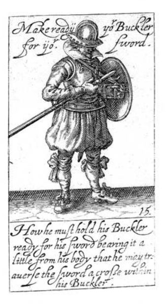
Figure 1.2 Illustrations from the pamphlet Mars his Field , first printed by Roger Daniell in 1595, showing drill positions for pikemen equipped with shield and spear, a type of infantry recently introduced under the influence of ancient military treatises.