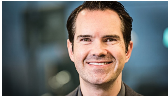
Figure 3 Jimmy Carr