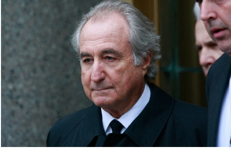
Figure 2 Bernie Maddoff