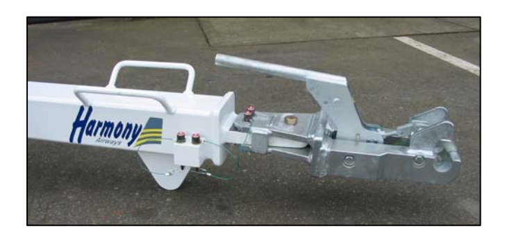
PSE 196 Embraer ERJ-175/190 Towhead Assembly (to be used on PSE-190E or PSE-190EF towbar assemblies)