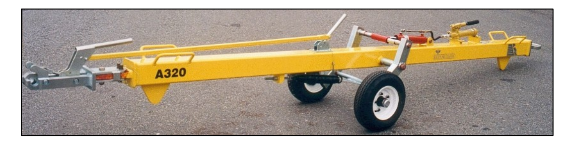
PSE 194 B757 Towhead Assembly

PSE 193 A320 Towhead Assembly (A318 / A319 / A320 / A321)