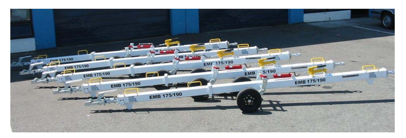
Illustration of a Extended Fly-Away Narrow Body Towbar equipped for Embraer use.

The narrow bodied towbar is designed for airline ramp use on all narrow bodied aircraft i.e. Boeing B727, B737, B757, Airbus A318, A319, A320, A321, Embraer ERJ-175/190, SSJ-95/100, and TU-204/214 aircraft. Each towbar includes torque and tow limiting shearpins designed and manufactured according to each aircraft manufacturers' specifications.