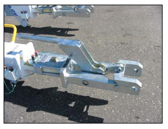
PSE 197 Sukoi SSJ-95/100 Towhead Assembly

PSE 198 Tupolev TU-204/214 Towhead Assembly