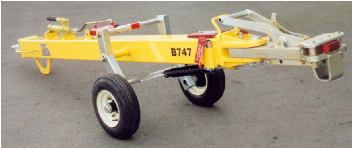
Illustration of a typical Wide Body Towbar complete with B747 towhead.

The wide bodied towbar is designed for airline ramp use on all wide bodied aircraft i.e. Boeing B747, B757, B767, B777, B787, McDonnell Douglas DC-10, MD-11, Lockheed L1011, Airbus A-300, A-310, A-330, A-340, and A380 aircraft. Each towbar includes torque and tow limiting shearpin designed and manufactured according to each aircraft manufacturers' specifications.