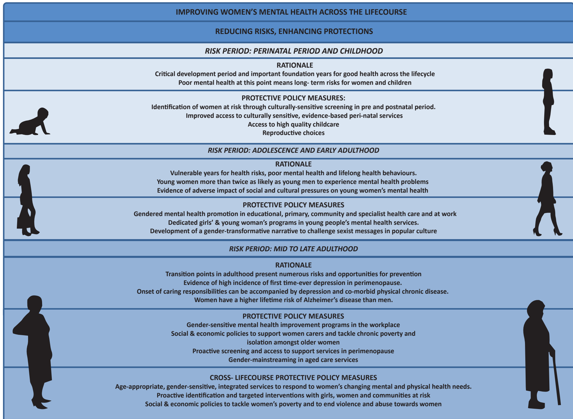
Figure 4: Lifecourse risks and protections , AHPC 2016