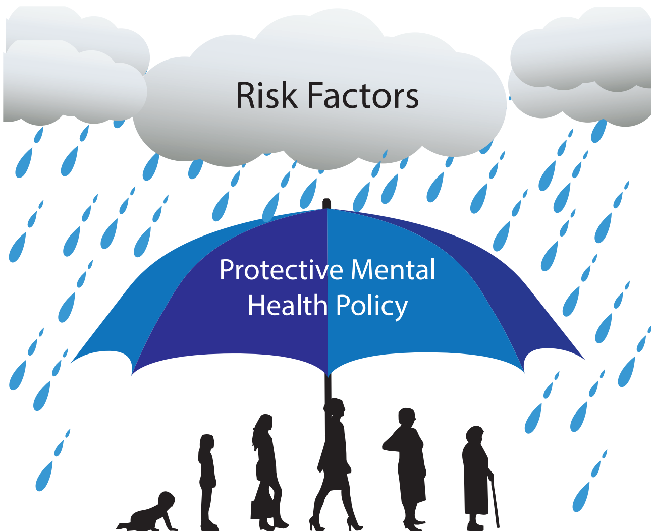
Figure 1 : Protective public policy

Goal 5: Investing in research and service innovation