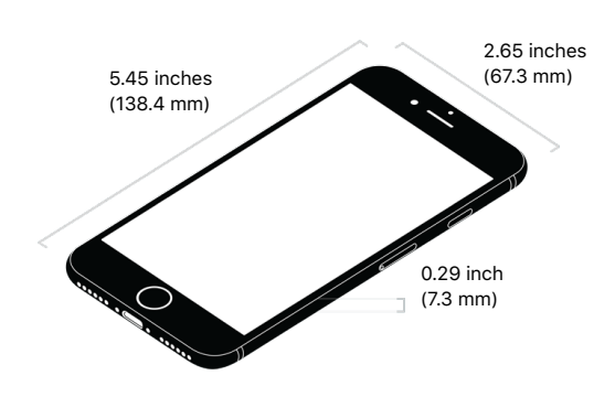
Weight: 5.22 ounces (148 grams)