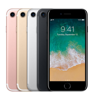
iPhone 7 Tech Specs