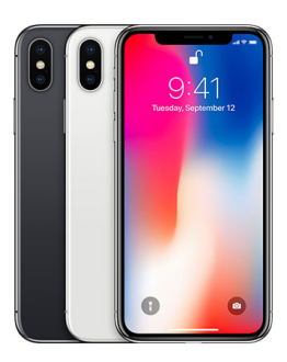
iPhone X Tech Specs

Apple takes a holistic view of materials management and waste minimization. Learn more about how to recycle your iPhone >