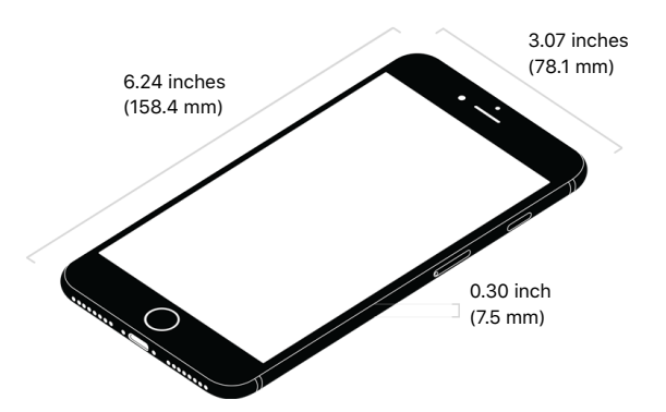
Weight: 7.13 ounces (202 grams)