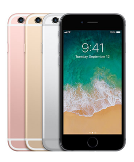
iPhone 6s Tech Specs