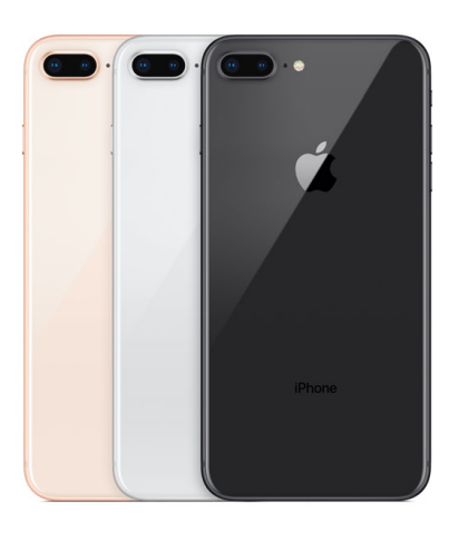
Gold, Silver, Space Gray