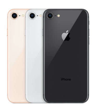
Gold, Silver, Space Gray