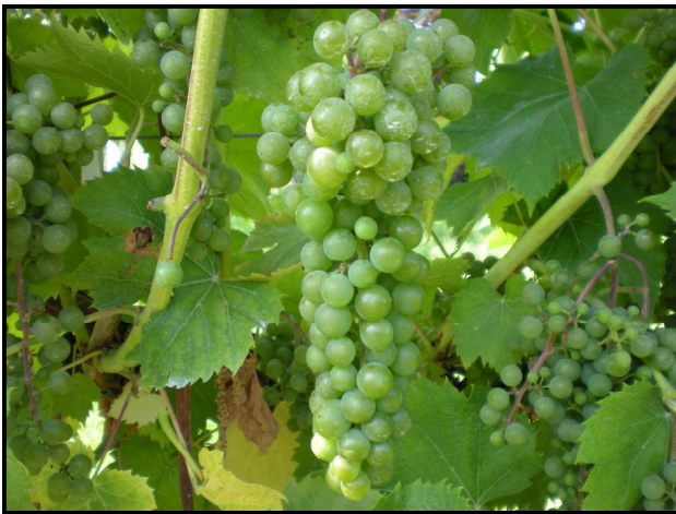
La Crescent at Peninsular ARS 9 September 2009