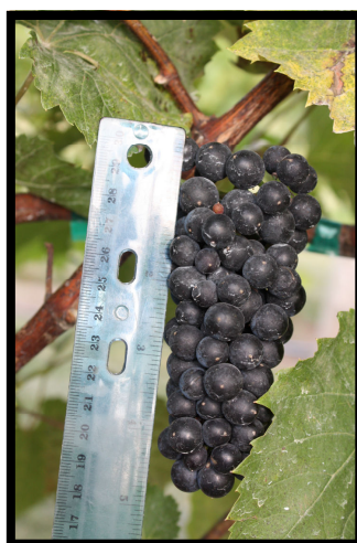
Foch September 10, 2009 22.8 Brix