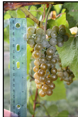
La Crescent at West Madison ARS 10 September 2009