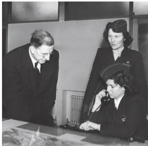
Eamon de Valera with Aer Lingus ground staff, Dublin Airport, 1947.