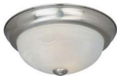
Flush Mount Satin Nickel