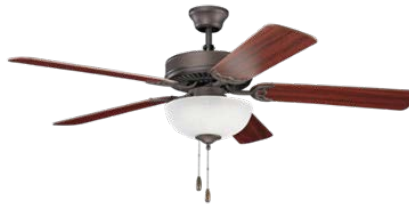
Ceiling Fan (Optional) Nickel or Bronze