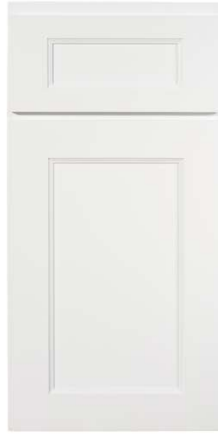
Brooklyn Bright White