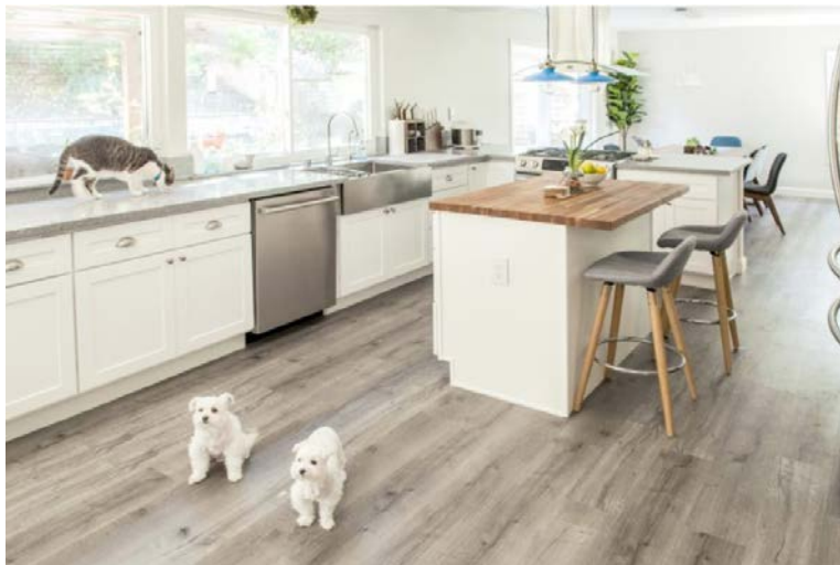
Flooring: LVP floor in kitchen, bath, laundry, and Entry. Carpet in balance of house.