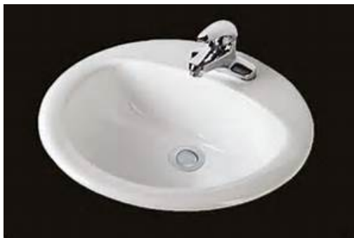
Bathroom Vanity Sink: China Vitreous Top mount sink.