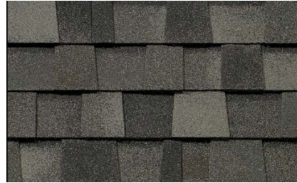
Roof: 30 year architectural asphalt Composite shingles