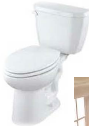
Bathroom Toilet: 2 piece elongated bowl toilet