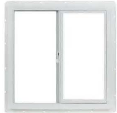
Windows: Vinyl extruded dual pane insulated low E windows

Exterior Siding: LP Smartside 8 lap siding with SmartTrim window & corner trim.