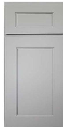
Brooklyn Modern Gray