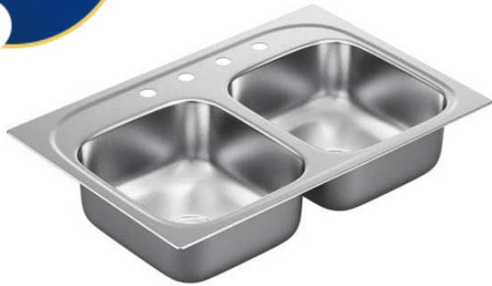
The kitchen Sink is a drop-in Stainless steel 8" Depth double bowl sink.