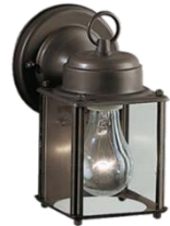
Outdoor Sides and Rear Bronze