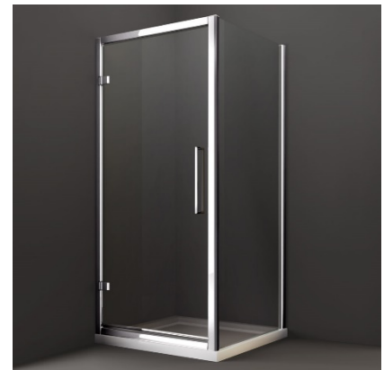
Bathroom Shower Enclosure: Clear glass Enclosure with chrome Frame (stand alone Shower only)

Irontown reserves the right to change or substitute any materials with comparable products without notification. Because each Irontown Homes is custom built some upgraded items may be shown in your desired floor plan. Exact specifications will be detailed for each project built and included in the purchase contract.