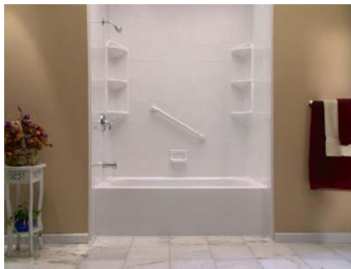
Bathroom Cast Tub/Shower Fiberglass insert Tub/surround enclosure