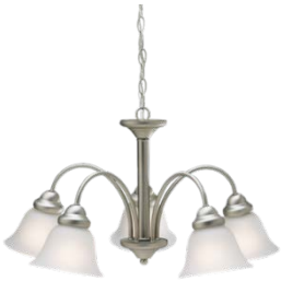
Dining Chandelier (can replace with 4 LED downlights, no charge) Nickel or Bronze