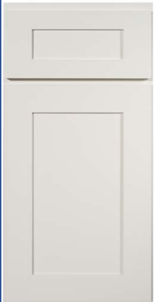
Shaker Designer White