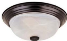
Flush Mount Oil Rubbed Bronze