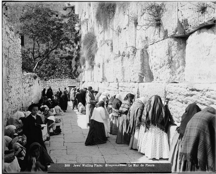
The sacredness of the Western Wall is a relatively recent phenomenon and an outgrowth of Sultan Suleiman I's (r.1520-66) rebuilding activities in Jerusalem. The site was originally just a narrow alley (above) that restricted its usage by the city's Jewish worshippers.