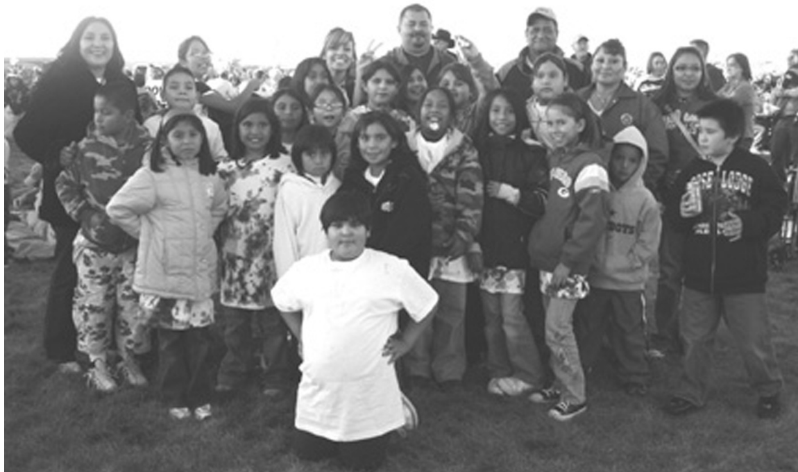
Group picture before the Balloon Glow 2009 started.

Thursday, November 5th, we have the return of our popular event Parent’s Night Out. From 5-8pm that evening we are offering the parents a chance to have some time to themselves. The library staff has planned fun, games, crafts and dinner for the first 20 children to sign up ahead of time. It is open to 3 year olds (must be potty trained) to teens. The parents will leave their child with us at 5pm and go do what they want until they pick them up at 7:30pm. Just a little reward for the many jobs parents do for their children. For further information, you can call the library and talk to anyone one of the staff members. The number to the library is 505.869.8119.