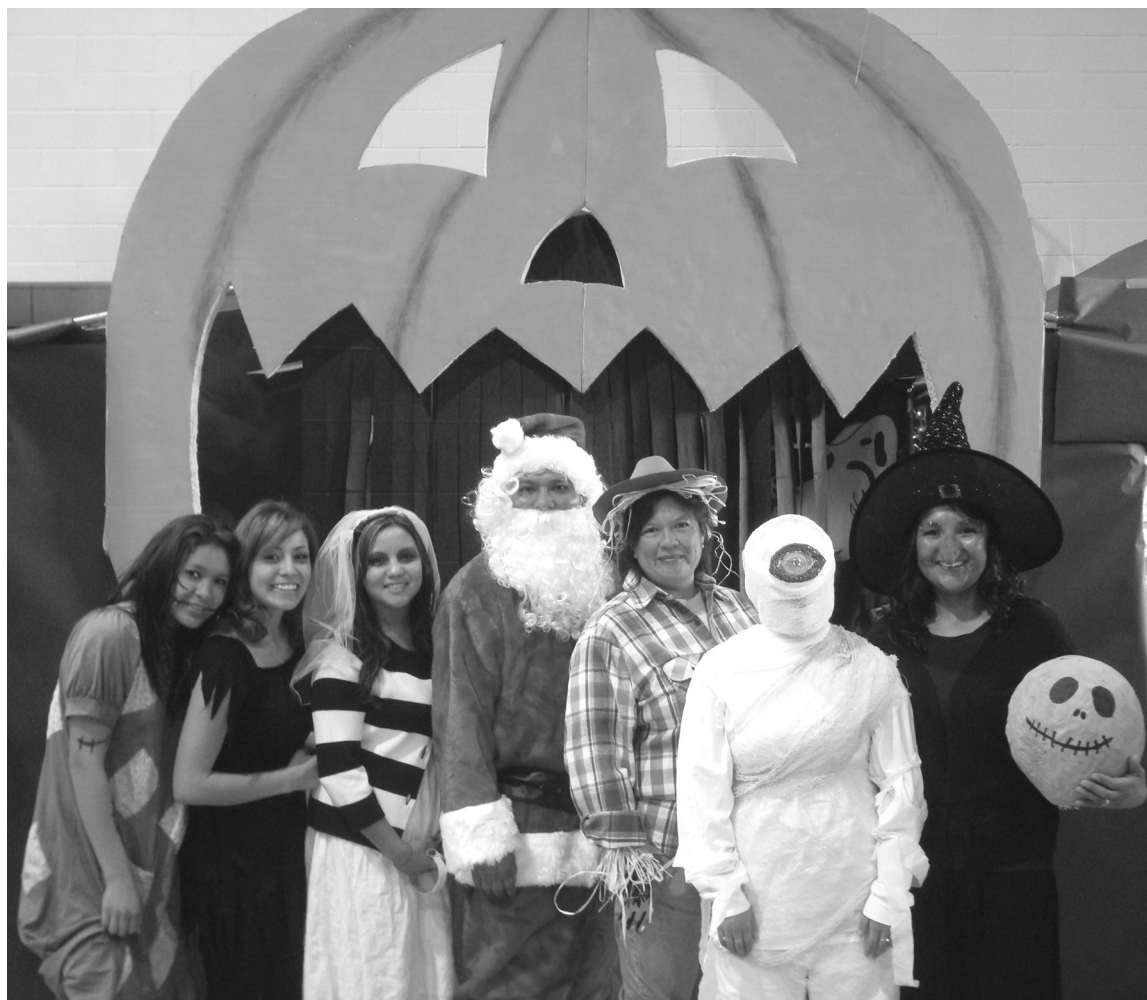
The Library Staff posing for a picture before the Halloween Carnival got started.

WebSite: http://www.isletapueblo.com/library2.html (Has gone LIVE but still under construction)