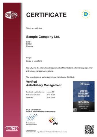
Global Conformity Certificate „Verified Anti-Bribery Management“