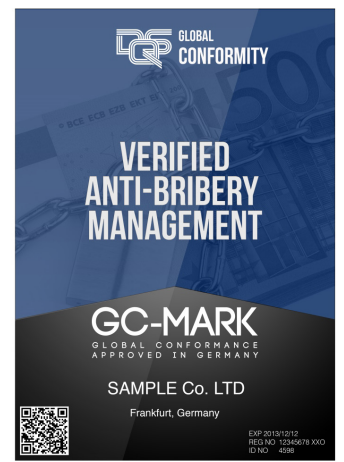
Global Conformity Label „Verified Anti-Bribery Management“