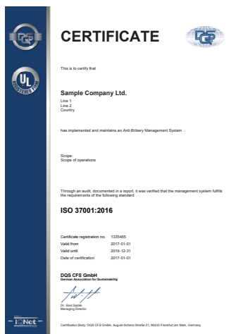
ISO 37001 Certificate

As such, it translates ISO certification into a visually attractive and easily understandable message.