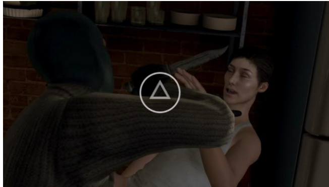
Figure 2: Madison must survive the burglar's attacks.

Example: Madison, one of four controllable characters from Heavy Rain (Quantic Dream 2010), should avoid being stabbed by a burglar/assassin at her apartment on a series of risky maneuvers that require agile reflexes in order to survive. The player must press the button in a short period of time for the action to be successful, see Figure 2.