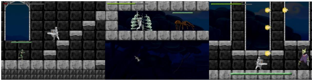
Figure 4: Prototype's screenshots.

As an object of research, a side scroller game with a medieval dark fantasy theme was developed, as shown in Figure 4, in which the player could perform eight different actions, besides the actions of walking and jumping. The eight actions were defined according to the categories of effort, duration and context, in order to adapt to the isomorphic interaction technique patterns and the theme of the game described in the game concept. These are: attack, 3 hit combo, guard, throw spear, reflect projectile, activate lever, escape from spider web, defeat the Ghost King.