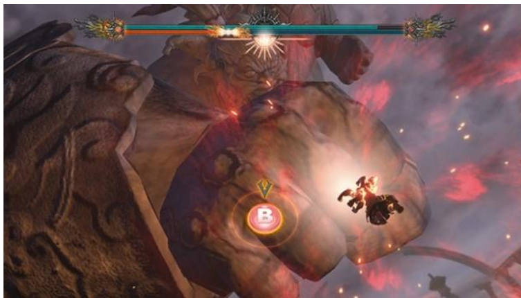
Figure 3: Asura challenges a much bigger foe.

Example: In the game Asura's Wrath (CyberConnect2 2012), the main character faces an enemy many times his size in a contest of strength. The player must pump the button in order to defeat the enemy, illustrated by Figure 3.