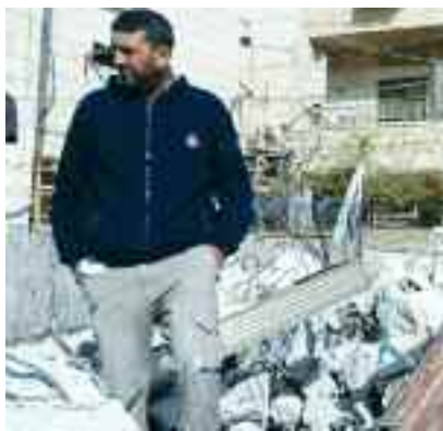
A man walks through the rubble of the Beit Hanina home demolished on orders of the government

Three months after the Jerusalem Municipality announced plans to demolish 14 illegally built homes in east Jerusalem's Beit Hanina neighborhood, government bulldozers razed the first Arab residence there, displacing a family of seven.