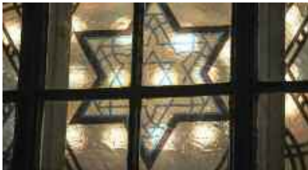
A window is pictured with the Star of David in a new synagogue in Cottbus, Germany.