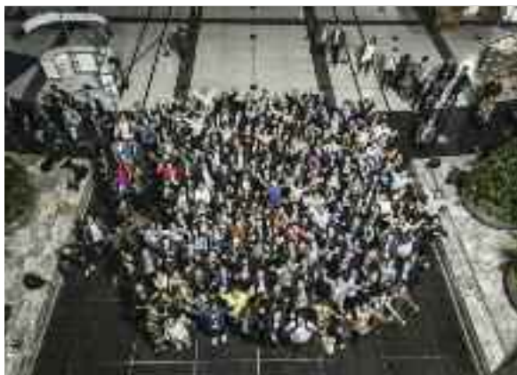
Forbes "under 30" summit.

"They come early and they stay late and they don't sleep," Lane said.