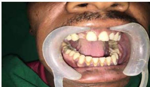
Fig 17: Pre-Op Left Angle and Right Para Symphysis Fracture