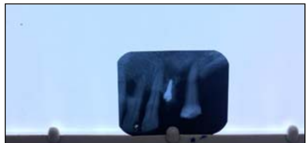
Fig 22: Showing Minor Contact of The Root With Screw Hole