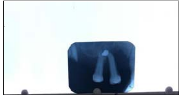
Fig 21: Showing Minor Contact Of The Root With Screw Hole