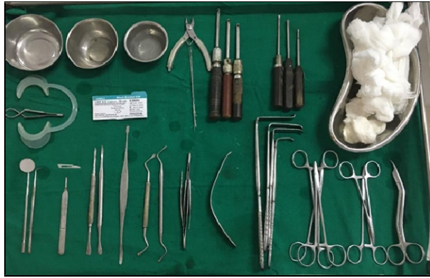
Fig 1: Armamentarium For Inter Maxillary Fixation

stability was adequate in 70% of the patients and inadequate in 30% of the patients while in Erich arch bars group, stability was adequate in 80% of the patients and inadequate in 20% of the patients. Oral hygiene status of patients pre and post operatively- in Erich arch bar group, 11 patients were with poor oral hygiene (55.0%) and 9 patients were with fair oral hygiene (45%) while in Self-drill screws group, 7 patients were with poor oral hygiene (35%) and 13 patients were with fair oral hygiene (65%), pre operatively. Post-operatively, in Erich arch bar group, 12 patients had fair oral hygiene (60%) and 8 patients had good oral hygiene (40%) while in Self-drill screws group, 5 patients had fair oral hygiene (25%) and 15 patients had good oral hygiene (75%).