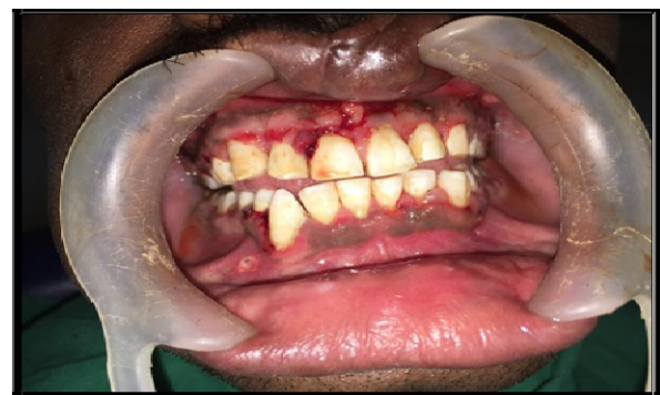
Fig 23: Showing Malocclusion In Self Drill Screws Patient After Removal