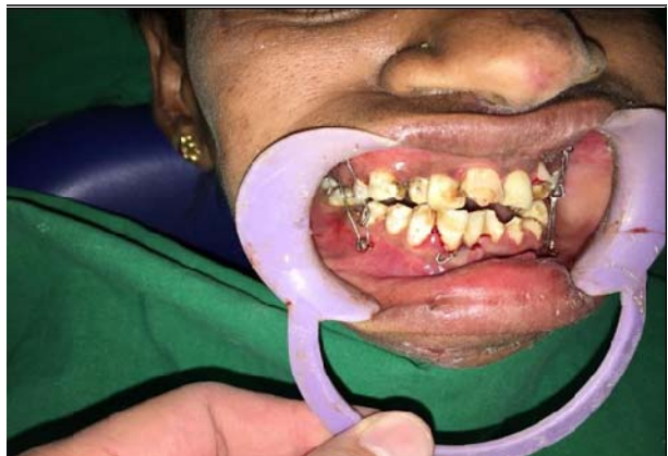
Fig 7: Post-Operative Placement Of Self Drilling Screws