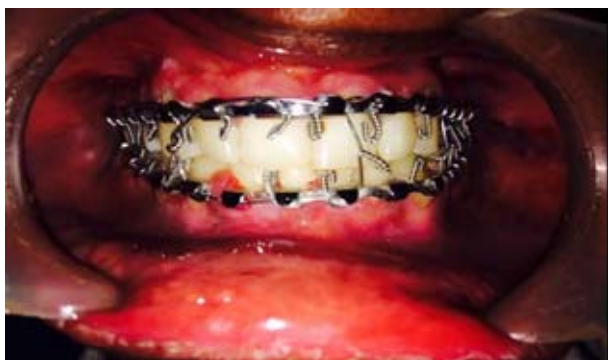
Fig 11: Post-Operative Placement of Erich Arch Bar