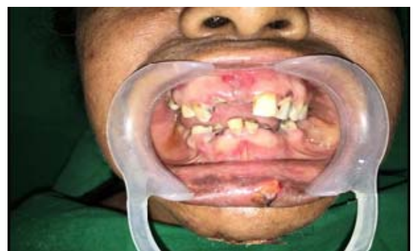
Fig 13: Pre-Op Left Angle and Bilateral Condylar Fracture