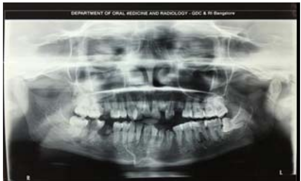
Fig 6: Pre-Op Opg