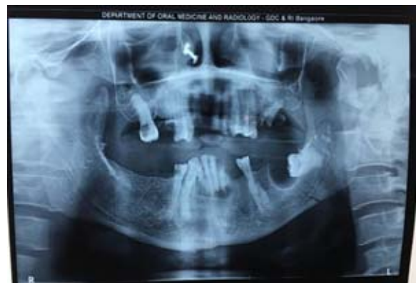
Fig 14: Pre-Op Opg