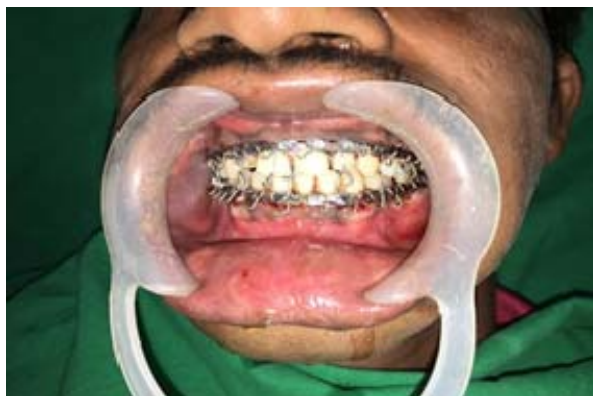
Fig 19: Post-Operative Placement of Erich Arch Bar