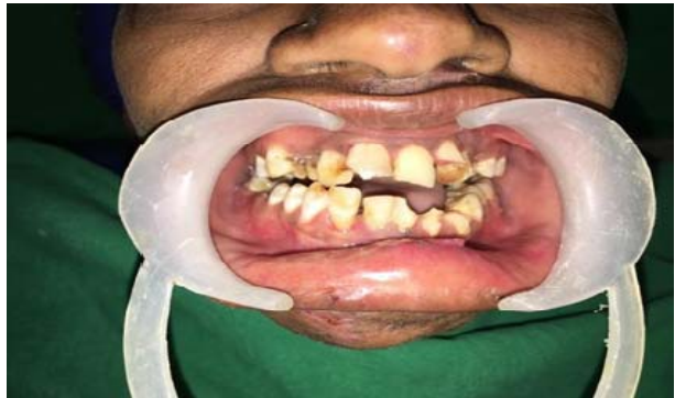
Fig 5: Pre-Op Right Parasymphysis and Left Condyle Fracture