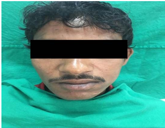
Fig 16: Shows Pre -Operative Facial Profile.