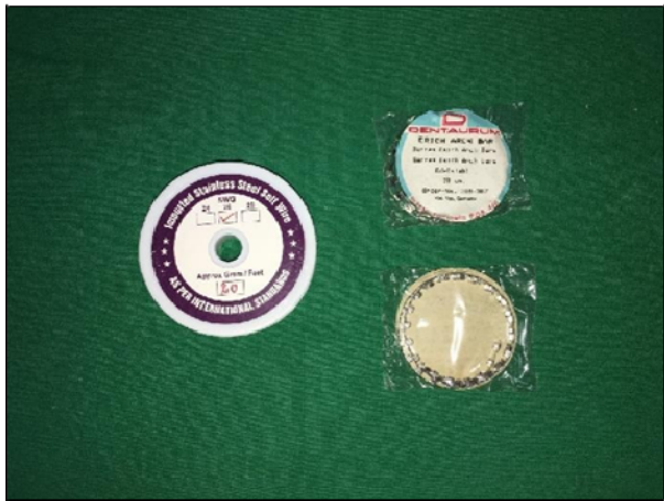
Fig 3: Erich Arch Bar