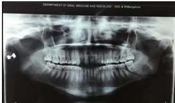
Fig 18: PRE-OP OPG