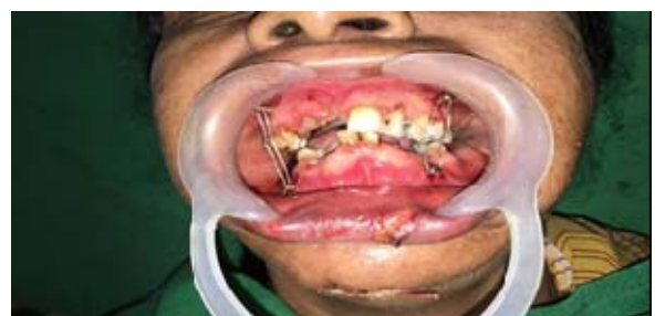
Fig 15: post-operative placement of self-drilling screws