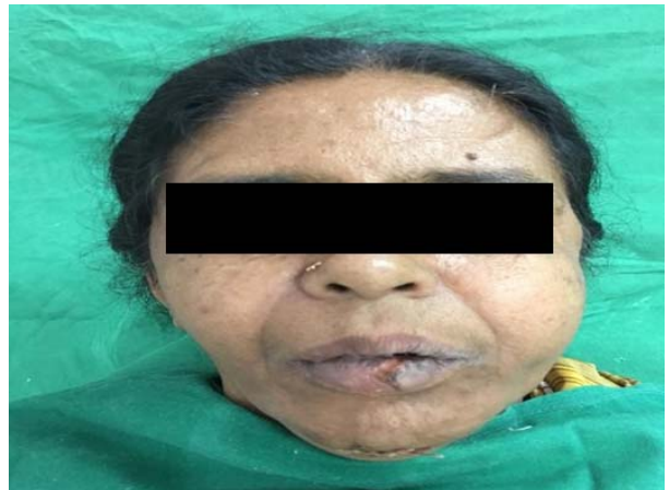
Fig 12: Shows Pre -Operative Facial Profile.