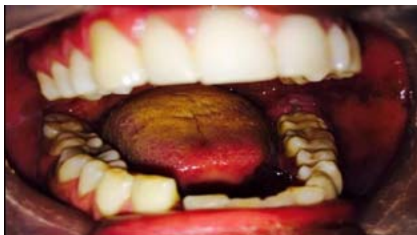
Fig 9: Pre-Op Right Parasymphysis Fracture And Left Angle Fracture