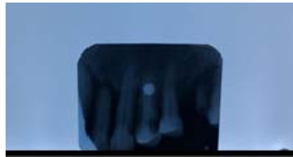
Fig 20: Showing Major Contact Of The Root With Screw Hole