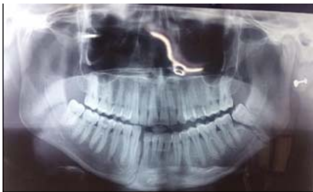
Fig 10: Pre-op OPG