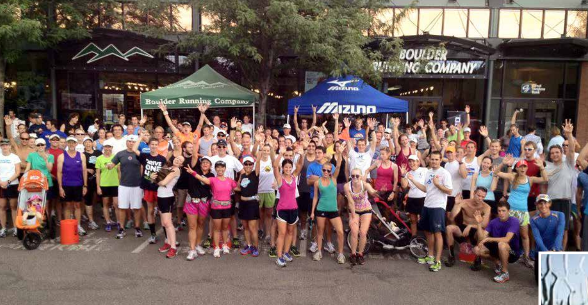
The scene at a recent Boulder Running Company Wednesday evening run.

Running Company locations in metro Denver and possibly other markets based on the broad appeal of the name and the store's national reputation.