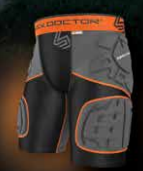
ULTRA SHOCKSKIN 5-PAD IMPACT SHORT