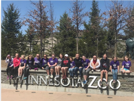
The Jobs Daughters spring mystery trip to the MN Zoo