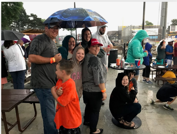
It was a little rainy but the Brothers of Mankato Lodge 12 had a great time at the Moondogs season opener!