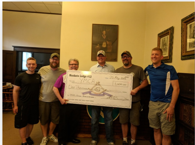
Blue Lodge proudly presenting a $1,000 Charitable donation to the local YMCA.