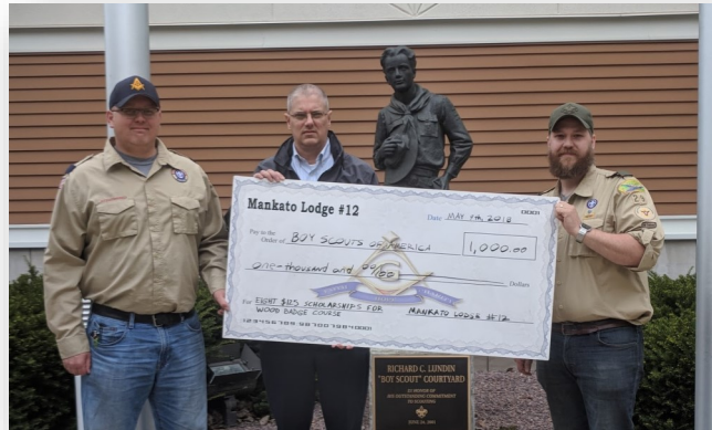
Blue Lodge proudly presenting a $1,000 Charitable donation to the Boy Scouts of America to help local leaders go to training.