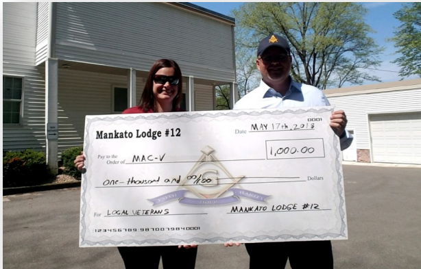
Blue Lodge proudly presenting a $1,000 Charitable donation to Mankato MAC-V.