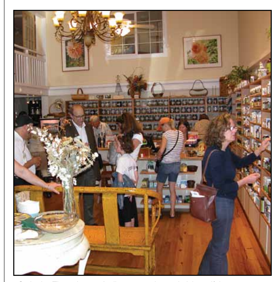
Gathering Thyme hosts a April 19, 2012 mixer at their beautiful store