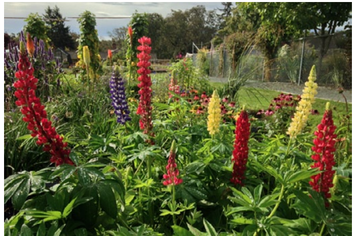
Photo Group Favourites from September, 2015 https://photos15.smugmug.com/Sept15Chosen/