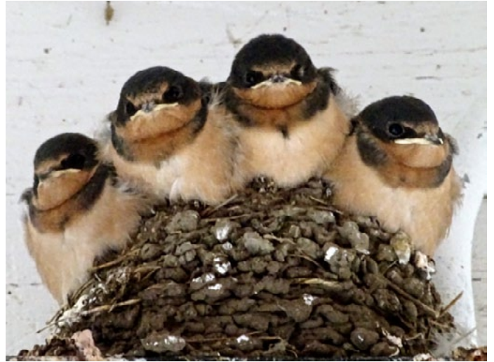
Photo Group Favourites from August, 2015 https://photos15.smugmug.com/Aug-15-Chosen/

The Photo Group welcomes new members. Please email kate-cino@shaw.ca