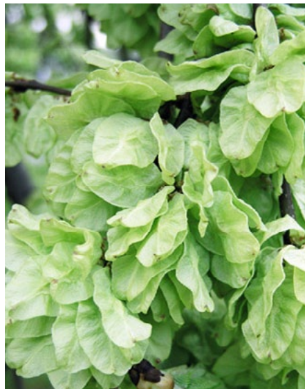
The lush obovate leaves that crowd the crown of the tree.