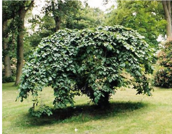
The original tree, located on the Camperdown Estate in Dundee, Scotland.

It is sometimes confused with Ulmus glabra 'Pendula' as they are both weeping trees with similar albeit confusing forms. However, 'Camperdownii' produces a dome shaped crown, while 'Pendula' produces a stiff, flat crown.