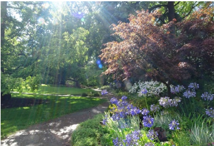
Photo Group Favourites from July, 2015 https://photos15.smugmug.com/July-15-Chosen/