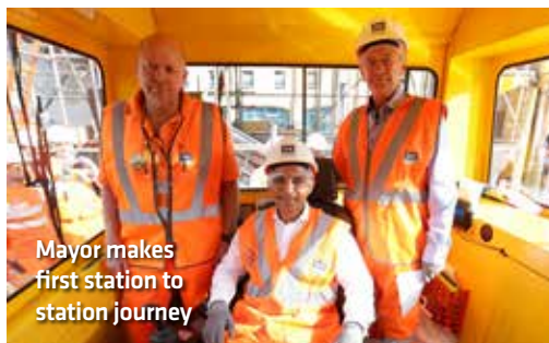
Mayor makes first station to station journey

Architectural features such as the curved concrete wall cladding that is characteristic of the underground platforms, the timber beams of Abbey Wood station and the green roof structure at Whitechapel station can now be seen. More of these bespoke designs will come to life as the programme to deliver London's