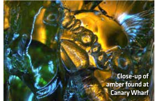
Close-up of amber found at Canary Wharf

Two front ends of Mammuthus primigenius (woolly mammoth) jawbone and a piece of Crossrail amber, found more than 25 metres beneath Crossrail's construction site at Canary Wharf, are now both on display at the Natural History Museum.