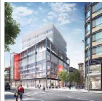
Tottenham Court Road, 1 Oxford Street

Portland stone is used for the eight floor office development above the station. Adjoining developments around the eastern ticket hall will include new homes and retail space - and, in partnership with Westminster Council and developers, a transformed Hanover Square.