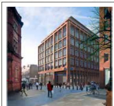
Bond Street, Davies Street

The proposed designs of homes, retail units and offices at 12 sites above or near the new central London stations take inspiration from local communities and surrounding architecture.