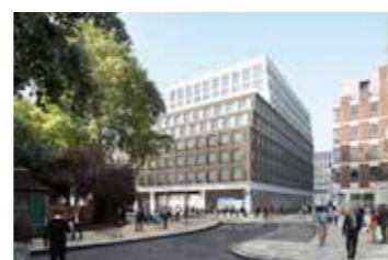
Bond Street, Hanover Square

A six storey office building above the station references the red brick familiar to local buildings.