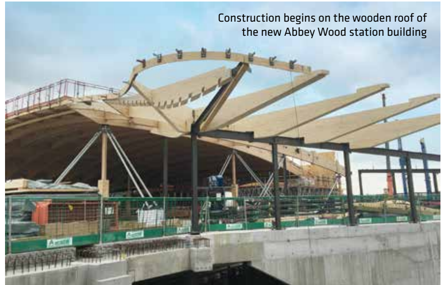
Construction begins on the wooden roof of the new Abbey Wood station building

Electrification work is progressing in the west with most of the steel gantries now in place and the overhead wires, which will power the new trains, being installed throughout the autumn.