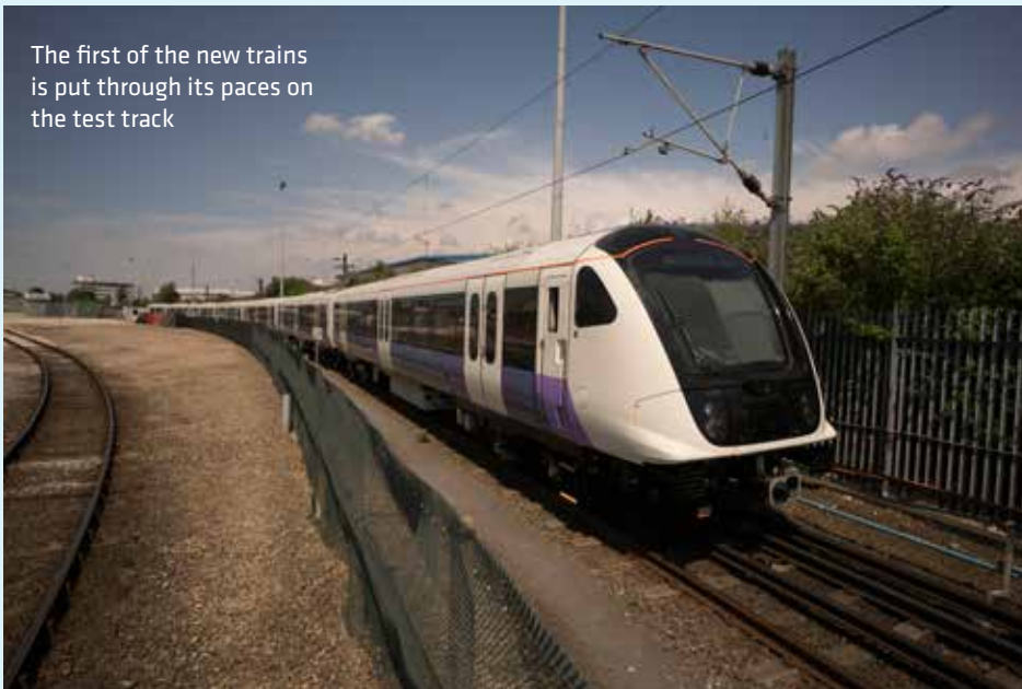
The first of the new trains is put through its paces on the test track

The first of the new Elizabeth line trains has been unveiled by Transport for London. A fleet of 66 new trains will operate on the Elizabeth line when it opens from 2018.