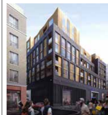
Tottenham Court Road, Dean Street

Two eight storey office and retail developments, linked by a new pedestrian area in Sutton Row, will include the first new West End theatre in over a decade.