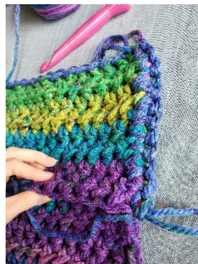
Figure 1 – Joining Shoulders & Sides

Join in 10 th (11 th , 11 th , 12 th , 12 th , 13 th , 13 th , 14 th ) st from top of shoulder, ch 1, sc down side of hoodie to last 5 at bottom of Front Panel and last 8 at bottom of Back Panel ( Figure 2 ).