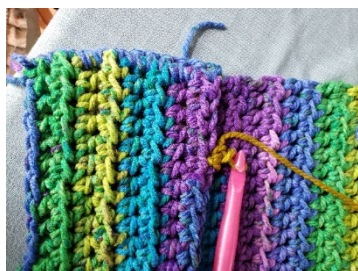
Figure 3 - Joining Hood

Rows 2-18: Ch 1, hdc in each across, turn. Fasten off, leaving long tail for sewing top of Hood using preferred method.