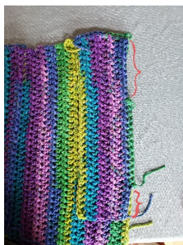
Figure 2 - Armhole Created

Design by: Evelyn Burtram of Pink Sheep Designs