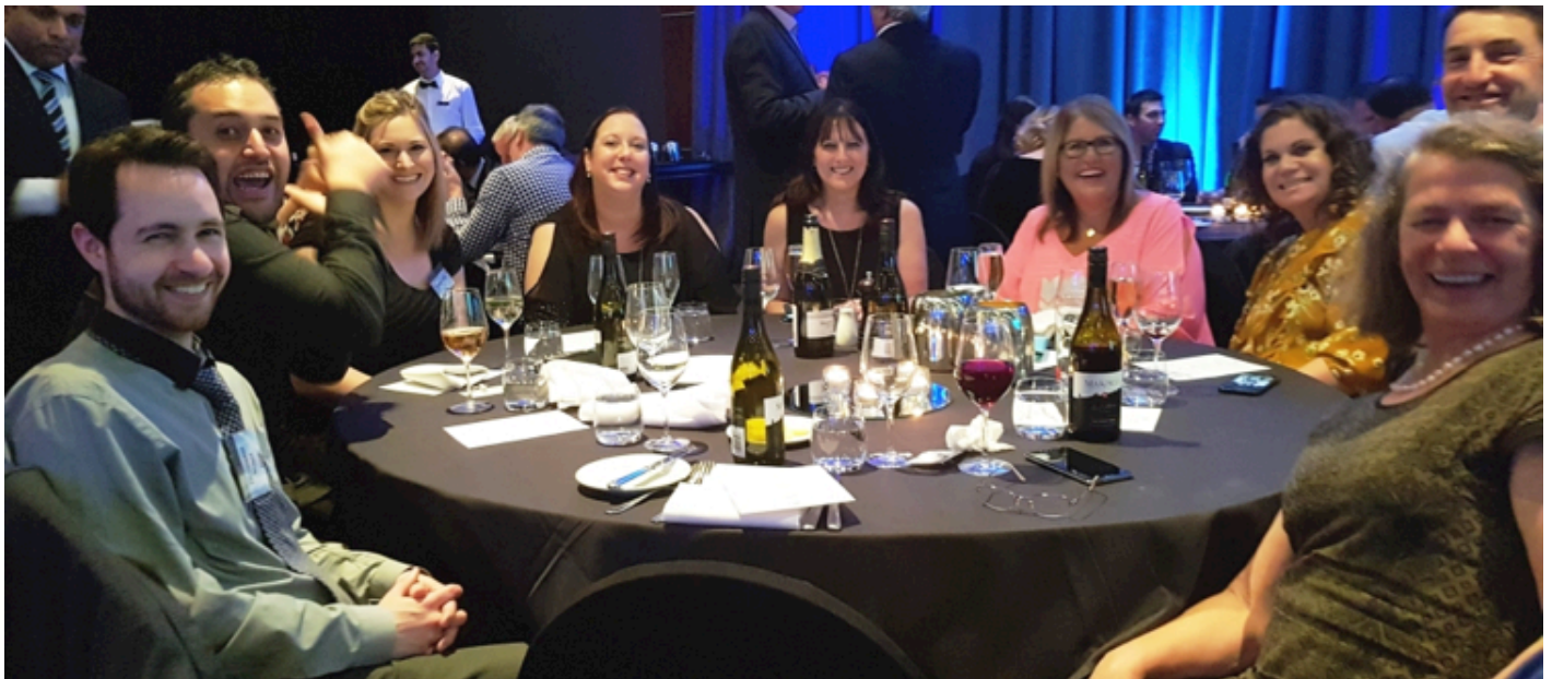
Delegates at the President's Dinner.