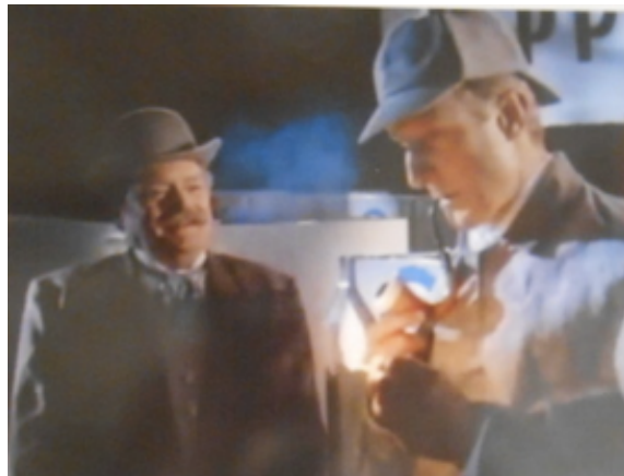
Bernard Fox (1927 - ) and James Cromwell (1940)

James Cromwell (1940 - ) , who was later nominated for an Academy Award in 1995 for his role as Farmer Arthur Hoggett in the movie "Babe" played the role of Sherlock Holmes, in "Sherlock Holmes - The Case of the Blue Clue" an award-Winning TV Commercial (1986). He also won an Emmy Award in 2003 for his role as George Sibley in the Six Feet Under television series. The role of Dr. Watson was played by Bernard Fox (1927 - ) , a British actor who is probably still best known for his role as Dr. Bombay in the Bewitched television series in the 1960s. Bernard Fox also played Dr. Watson in 1972 HOUN, with Stewart Granger as Holmes.