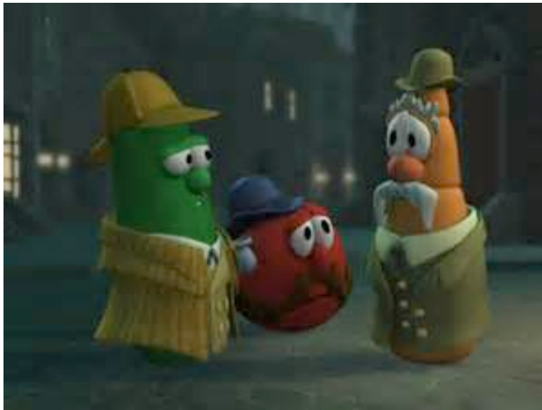
Larry the Cucumber and Bob the Tomato

Larry the Cucumber is detective dynamo Sheerluck Holmes and Bob the Tomato his venerable sidekick Dr. Watson, in "Sheerluck Holmes and the Golden Ruler" (2006). It was the twenty-second episode in the VeggieTales series. Subtitled "A Lesson in Friendship", it features two stories that illustrate what it means to be a good friend. The first is a parody of Don Quixote de la Mancha by Miguel de Cervantes. The second is a parody of the Sherlock Holmes novels and stories by Sir Arthur Conan Doyle. "Sheerluck Holmes" opens up to Sheerluck and Watson entering Doyle's ice cream parlor, claiming they have "The Howling Dogs of Baker Street" case wrapped up. Sheerluck takes all the credit and praise, upsetting Watson. After leaving, Scooter informs the duo of a plot to steal the Golden Ruler, the kingdom's most valuable treasure.