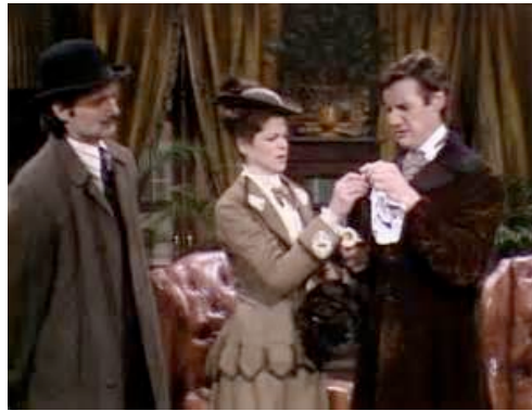
Bill Murray, Jane Curtin and Michael Palin

Michael Palin (1943 - ) and Dan Ackroyd (1952) - played Holmes and Watson in “The Forgotten Memoirs of Sherlock Holmes -The Case of the Scarlet Membrane” (1978) a skit on “Saturday Night Live”. A coked-up Sherlock Holmes has trouble staying focused on his various cases and instead lives his life as a paranoid detective who can become agitated at the slightest things. Palin walking around with the rolled-up dollar bill up his nose was a great sight gag, coupled with the weird things he did like play violin and shoot at a target on the wall. In one part Holmes tells Watson some man’s life story simply by looking at him but, it was simply a statue.