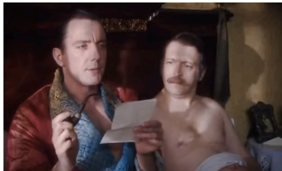
David Mitchell and Robert Webb

David Mitchell (1974 - ) and Robert Webb (1972 - ) , Mitchell and Webb, are a British comedy double act. On their TV show "That Mitchell And Webb Look", they had numerous Sherlock Holmes skits. Below are three good clips from (2006).