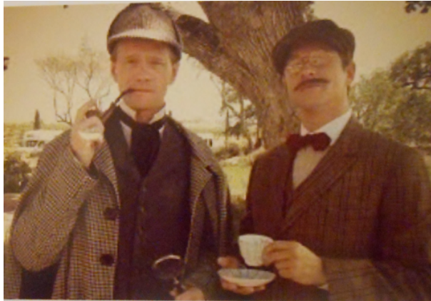
Neil Patrick Harris and David Burkta

Neil Patrick Harris (1973 - ) - in the teen comedy drama "Doogie Howser M.D.", an episode titled "The Adventures of Sherlock Howser" (1993), Harris as the title character Doogie Howser dresses up and imitates Sherlock Holmes. Max Casella (1967 - ) , as Vinnie Delpino, plays the Dr. Watson role. In this particular picture you can see Neil Patrick Harris dressed as Holmes alongside his life-partner David Burkta as Watson, due to a mystery themed wedding they were in attendance for.