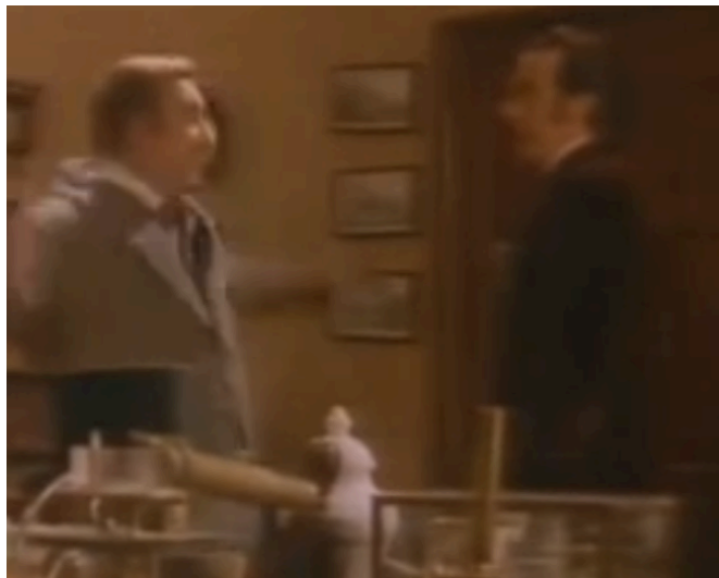
Alexei Sayle and Peter Capaldi

Peter Capaldi (1958 - ) - played Sherlock Holmes and Alexei Sayle (1952 - ) played Dr. Watson in "The All New Alexei Sayle Show" (1995).