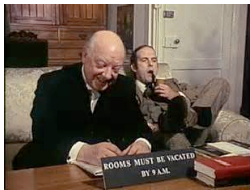
Arthur Lowe and John Cleese

John Cleese (1939 - ) and Arthur Lowe (1915 -1982) - the grandson of the world's first and foremost consulting detective, John Cleese as Arthur Sherlock Holmes, and his bumbling, bionic sidekick, Arthur Lowe as Dr. William Watson, attempt to catch the only living descendant of Professor Moriarty, in the TV movie “The Strange Case of the End of Civilization as We Know It” (1977).