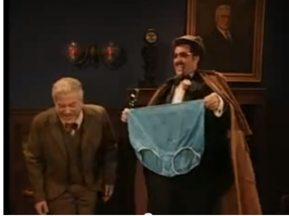
Darrell Hammond and Will Ferrell

Will Ferrell (1967 - ) and Darrell Hammond (1955 - ) , in the ‘Robert Goulet All Holiday Special, on ‘Saturday Night Live’ (2001), played Holmes and Watson. In this crazy bit the clue is Monica Lewinsky’s underwear.