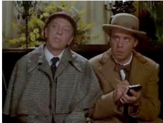
Don Knotts and Tim Conway

Don Knotts (1924 - 2006) and Tim Conway (1933 - ) - in the comedy mystery film “The Private Eyes” (1980), the pair play bumbling American detectives who unexplicitly work for Scotland yard, an obvious parody of Sherlock Holme and Dr. Watson. As Inspector Winship and Dr. Tart they investigate a strange death in a possibly haunted mansion.