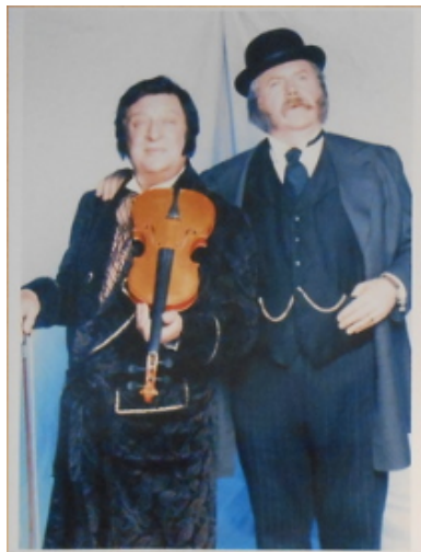
Rodney Dangerfield and Chuck McCann

Rodney Dangerfield (1921 - 2004) and Chuck McCann (1934 - ) teamed up for a handful of comedic sketches playing our favorite detective and doctor duo in the television special "Rodney's Place" (1989). Comic actor Dangerfield was well known for his "I don't get no respect".