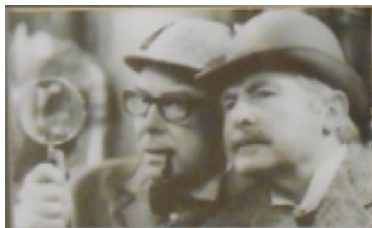
Eric Morecambe and Ernie Wise

Eric Morecambe (1926 - 1984) and Ernie Wise (1925 - 1999) - performed a number of Sherlock Holmes skits on “The Morecambe & Wise Show” (1978-83).