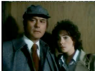
Larry Hagman and Jenny O'Hara

Larry Hagman (1931 - 2012) and Jenny O'Hara (1942 - ) - "The Return Of The Worlds Greatest Detective" (1976), was a pilot show on NBC, which starred Larry Hagman as an inept motorcycle cop named Sherman Holmes, who after sustaining a head injury became convinced that he was Sherlock Holmes. Jenny O'Hara was Dr. Joan Watson his psychiatric social worker. It's a shame that this was never made into a television series as it was originally intended for.