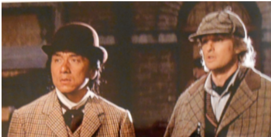
Jackie Chan and Owen Wilson

Owen Wilson (1968 - ) and Jackie Chan (1954 - ) at one point, in the film "Shanghai Knights" (2000), wear traditional Holmes/Watson garb as they meet a young Conan Doyle. The film contains references to Holmes culture too.