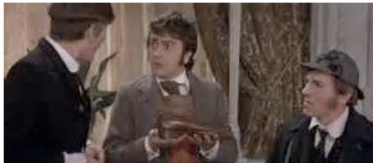
Peter Cook and Dudley Moore

Peter Cook (1937 - 1995) and Dudley Moore (1935 - 2002) - attempted a parody of "The Hound of The Baskervilles" (1977), with Peter Cook as Sherlock Holmes and Dudley Moore as Dr. Watson. I say attempted because I didn't find this film the least bit funny.