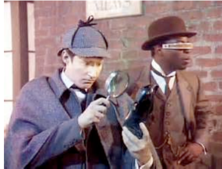
Brent Spiner & LeVar Burton

for Data and Geordi... were a lot of fun for us. I think the holodeck was a very cool concept, you know. You can create a three dimensional reality ... I mean, how cool is that?" 3