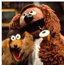
Rowlf and Baskerville

Rowlf the Dog portrayed Holmes, with Baskerville the Hound as Watson in "Sherlock Holmes and the "Case of the Disappearing Clues" (1976), the United Kingdom spot, from episode 103 of "The Muppet Show".