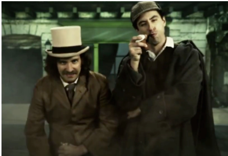
Kyle Mooney and Zach Sherwin

Zach Sherwin and Kyle Mooney lay down the rap as Sherlock Holmes And Doctor Watson in “Batman vs. Sherlock Holmes Rap Battle”. “Batman vs Sherlock Holmes is the twenty-sixth installment of Epic Rap Battles of History and the eleventh episode of Season 2. It features the greatest detective of all time, Sherlock Holmes, rapping against the crime-fighter from the comic series of the same name, Batman. It also features Sherlock's companion and friend, Dr. Watson, and Batman's side-kick and Boy Wonder, Robin. It was released on November 27th, 2012.” 1