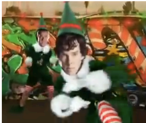
Martin Freeman and Benedict Cumberbatch

Benedict Cumberbatch and Martin Freeman as Sherlock Holmes and Dr. Watson doing the sugar plum fairy dance (2013).