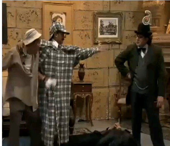
El Teatro Clásico - América TeVé

El Teatro Clásico - América TeVé an unusual Holmes & Watson show up around the 3 minute mark in this video (2013). Have your ever sat by a guy as annoying as the guy who keeps interrupting this play?