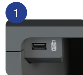
USB direct print*