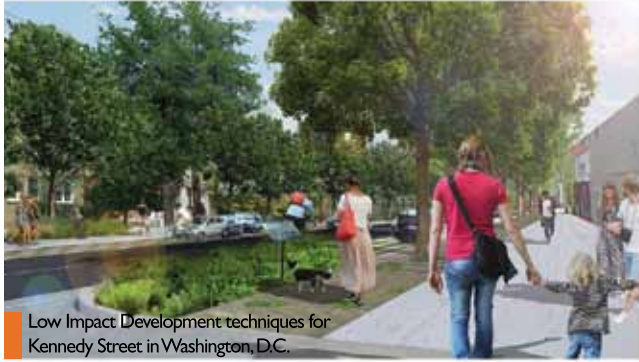
Low Impact Development techniques for Kennedy Street in Washington, D.C.

Nitsch Engineering . . . integrating green infrastructure design strategies to facilitate the goals of our municipal, development, and transportation clients.