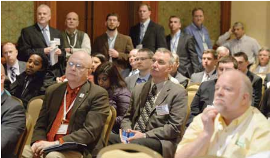
Exhibit Hall Break