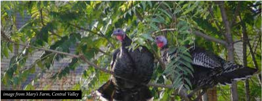
image from Mary's Farm, Central Valley

Since we started back in 1982, we've handpicked our turkeys to very exacting standards, and today, we're proud that every Bristol Farms turkey is free-range, raised in California, and delicious as can be.