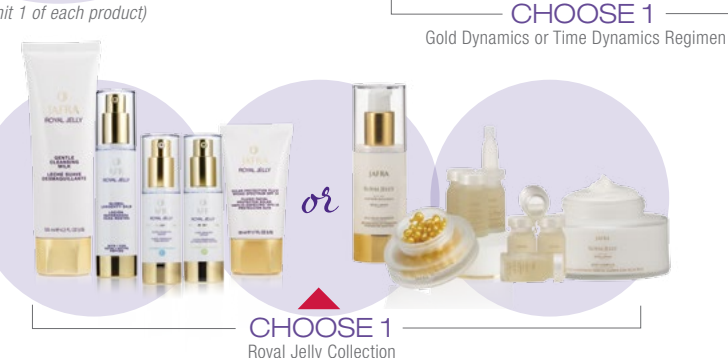
CHOOSE 4 (Limit 1 of each product)

For a complete listing of all products, see the New Consultant Packs flyer at iafrabiz.com > Consultant Connection > Downloads - Current Promotions.