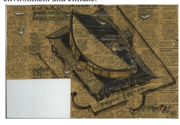
A Sketch of Onyang Museum, Pen on paper

This work was motivated by a private home in Korea built from red bricks. Bricks are made of earth, a basic material of nature, piled high to create a building. The view of the building made of earth developed from his efforts to secure an independent space within the harsh effects of the natural environment and climate.