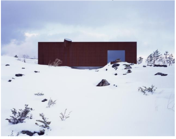
Stone Museum, 2006

This is a space of stones evoking poetic fantasy. The movement of light that enters through the open lotus-shaped hole within the dark box creates the sensation of a fantastical space. Steel plates are used for the floors, walls, and ceilings of the interior.