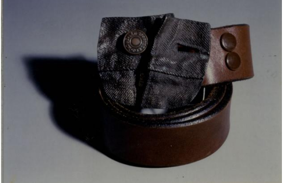
Designed by Itami Jun