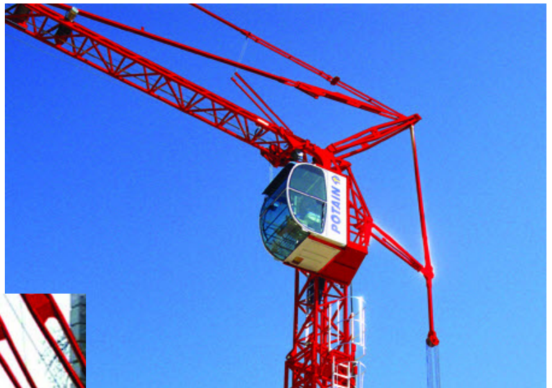
Potain MDT Igo T70A