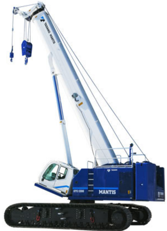
Todano GTC 800