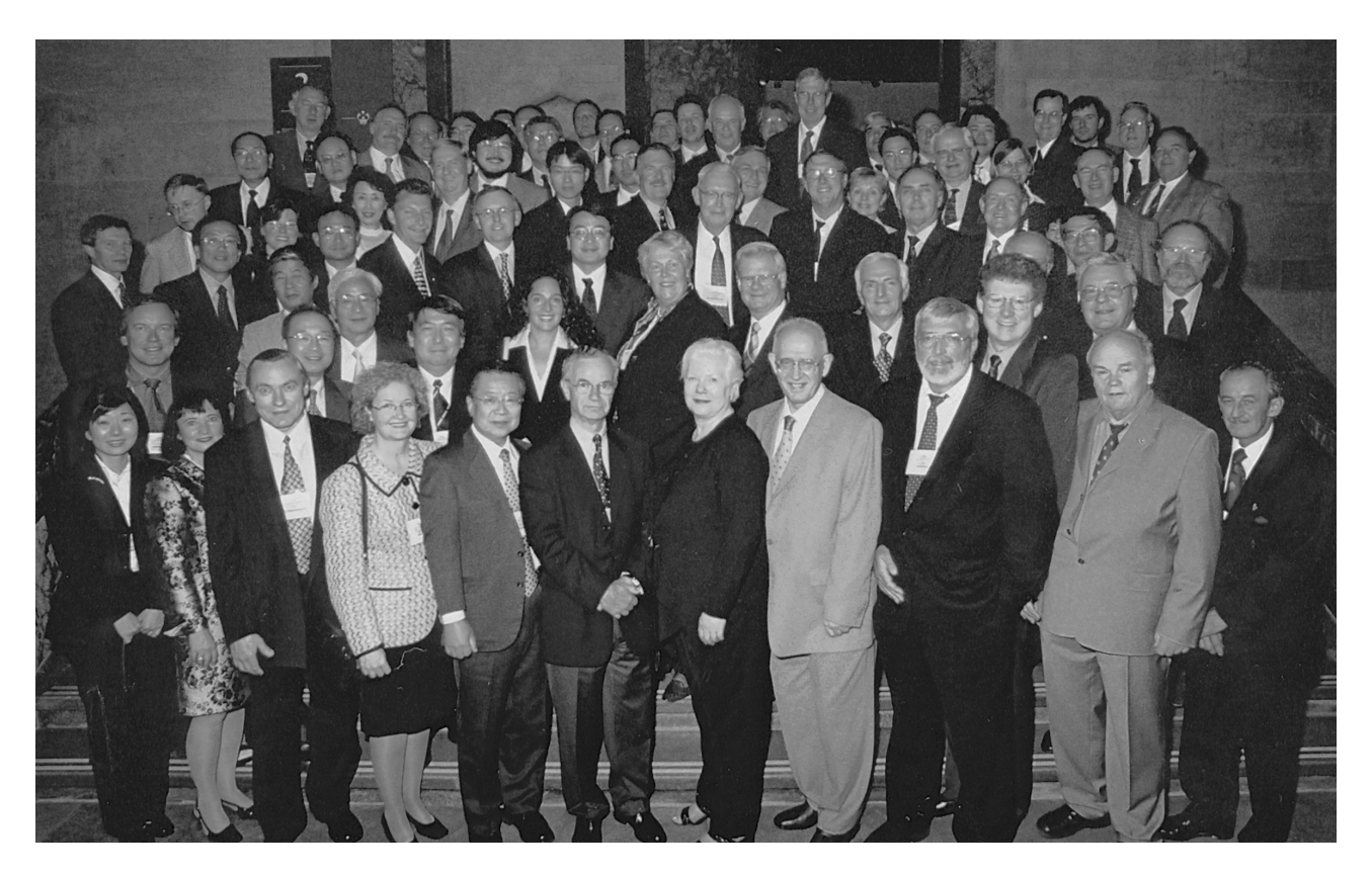
Participants in the Meeting