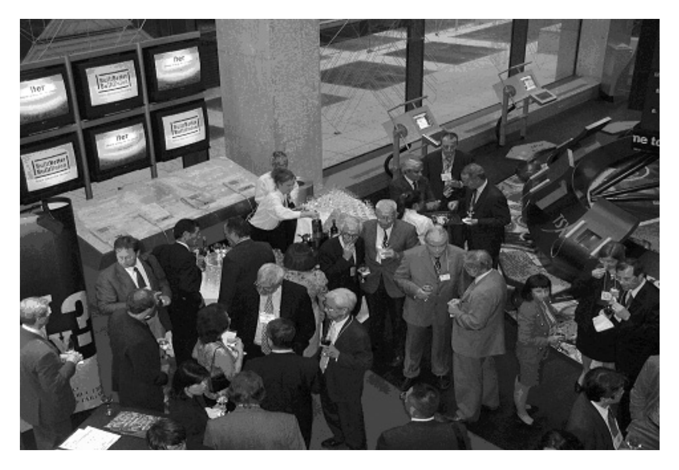
Delegates attend the Welcome Reception at the Toronto Stock Exchange.

During their stay in Toronto, the Negotiators attended special events hosted by supporters of Canada's offer to host ITER, including the Ontario Construction Secretariat, the governments of Ontario and Canada, and the Region of Durham and the Municipality of Clarington.