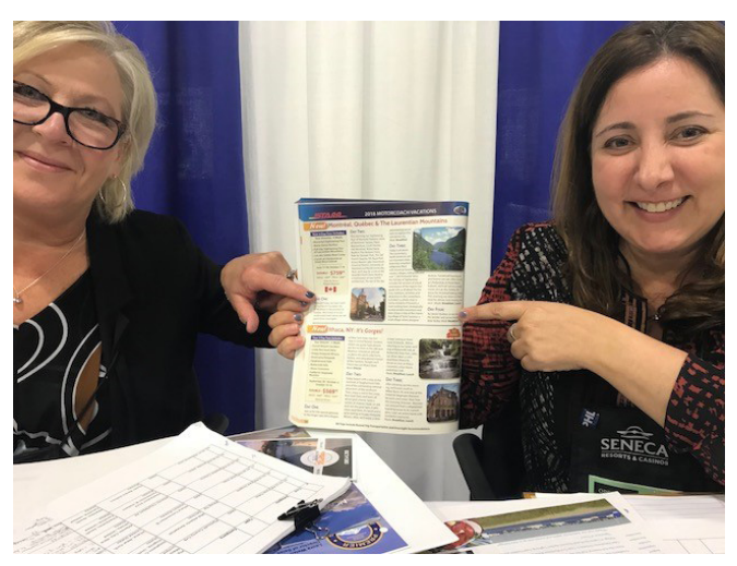
Starr Tours shares tour book at American Bus Association featuring an Ithaca/Tompkins County Tour

"Thank you for the tour of the various conference facilities in Ithaca. It was well organized and provided a good overview of the event space available. We came away with lots of options for consideration including some ideas for off-site guest tours."