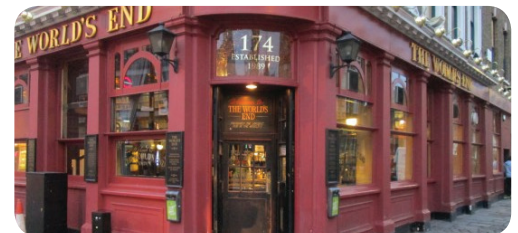
World's End Tavern