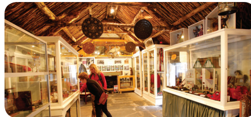
Highland Folk Museum