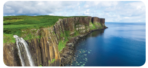
Isle of Skye