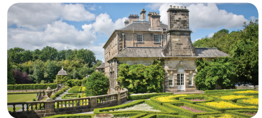
Pollok Country Park

Today we travel west from Edinburgh, Scotland's capital city, to the charming and artistic city of Glasgow . Upon arrival we visit George Square to see where Frank proposed to Claire. Next we head to Pollok Country Park , one of many locations that Claire searched for herbs. Next, visit Glasgow Cathedral , which was the location stand-in for the interior shots of L'Hopital des Anges. In Outlander Season 2, Episode 7, Claire is brought to L'Hopital des Anges when she starts having pain linked to her pregnancy. Your final visit of the day will be to the Kelvingrove Gallery , which was built to house the 1901 International Exhibition. The collection within ranges from local historical art to a Storm Trooper costume from the original Star Wars films. Head back to Edinburgh where you may like to freshen up before dining on your own.