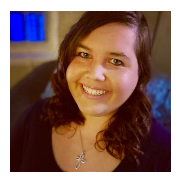
"I am the light of the world. He who follows Me shall not walk in darkness, but have the light of life" – John 8:12

I went into this walk with no expectations and a healthy dose of insecurity about the whole thing. At one point I was going to call my sponsor and tell her thank you, but I am just not able to go on the walk. God had other plans though.