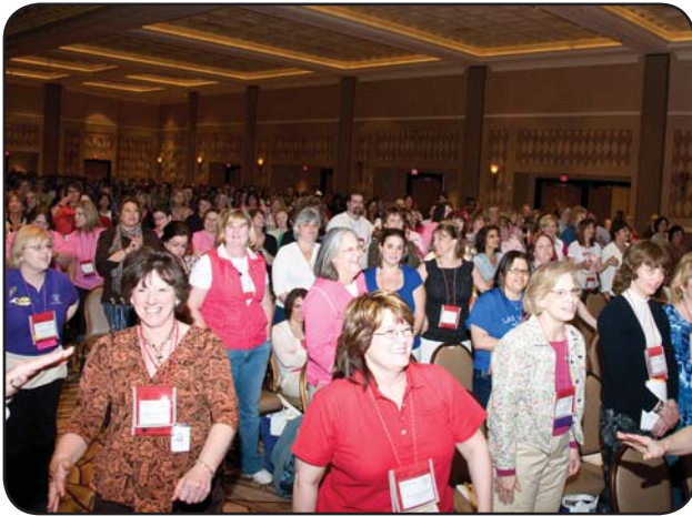
2009 AAPC Las Vegas National Conference