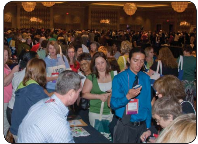
Las Vegas Exhibit Hall