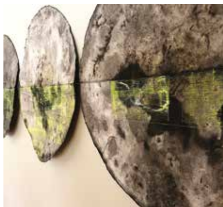
Image: Kathryn Blumke, Wellington Point Quilt 2 (portion 1) (detail) 2020, watercolour and graphite pencil on Arches paper.

Sunset at Wellington Point by Brisbane artist Kathryn Blumke presents a series of geometric watercolour paintings in response to her time spent observing the afternoon light over King Island at Wellington Point. Blumke is known for exploring sensations through grids, colour and circular form which she links to patterns in the natural environment.