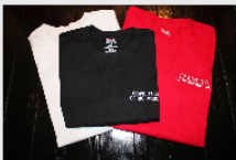
T-SHIRT (Short Sleeve) $16 NOW $12

Clearance pricing on in stock items only, while supplies last!