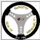
CLUB LOGO WINDOW STICKER (3"x3") $3