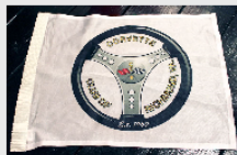
CLUB FLAG (white, 13"x9") $13 NOW $5