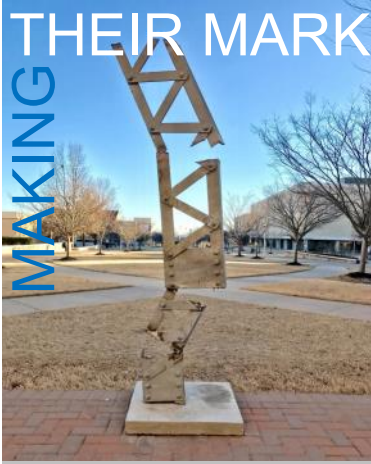
Jacob's art composed of Black River bridge trusses, donated to BRTC, on display next fall.