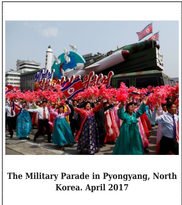
The Military Parade in Pyongyang, North Korea. April 2017

Secretary of State Rex Tillerson has declared that with regard to North Korea “the policy of strategic patience has ended. We are exploring a new range of diplomatic, security, and economic measures. All options are on the table.” 49 Tillerson explained that this includes the use of force: “Certainly, we do not want to—for things to get to a military conflict. [...] If [the North Koreans] elevate the threat of their weapons program to a level that we believe requires action, that option is on the table.”