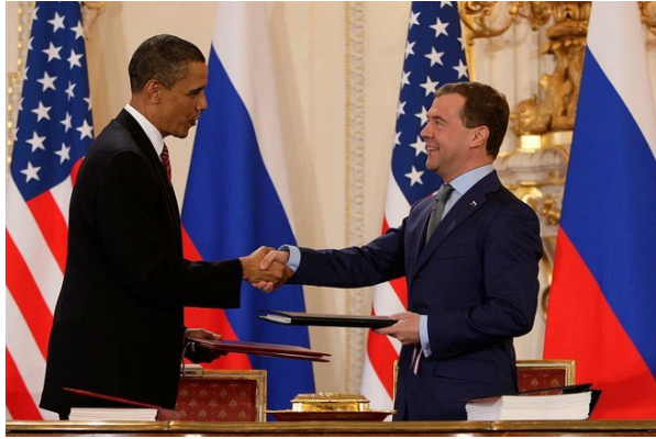
Barack Obama and Dmitry Medvedev after signing the “New Start Treaty in Prague in April 2010

President Obama in 2013 announced the possibility of further reductions of “deployed strategic nuclear weapons by up to one-third,” i.e., down to 1000-1100 weapons, ideally in negotiated cuts with Russia. 3 This language left open the possibility for unilateral cuts. It is worth recalling that, in 2000, President Putin had offered to cut to 1,000-1,500 warheads for each side, but U.S. President Clinton rejected it at the time. 4