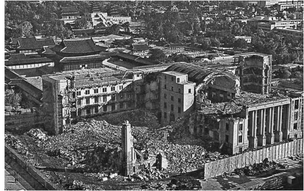
Figure 6.3 Demolition of former Japanese Government-General Building from Ministry of Culture and Sports, Koo Chosŏn chongdokbu gŏnmul (former Government-General Building in Korea) (Seoul: Ministry of Culture and Sport 1997).

The actual dismantling of the GGB began on the 50th anniversary of the Liberation Day on 15 August 1995. A grand national ceremony was broadcast throughout the country. Accompanied by fireworks, dances, and cheers, the highlight of the ceremony being the tearing off of the steeple on the top of the dome of the GGB. The decapitated steeple was exhibited at the site for a while and later moved to the Independence Hall of Korea, near Seoul. 11 A series of events to commemorate certain historical days or to celebrate festivals to revitalize national spirit was held at the site during the dismantling process (Ministry of Culture-Sports 1997: 356-357). The demolition of the GGB, however, had to be delayed by about a year due to litigation on the part of some citizens. In 1995 and 1996, civic groups opposed to the demolition of the GGB filed suits in the Seoul District Court, against the government and the Hyundai Construction Company, which was undertaking the actual work. However, the court rejected all these applications, affirming in its verdicts the need to revitalize 'national spirit and energy' by demolishing the GGB and restoring the Kyōngbok Palace (Ministry of Culture-Sports 1997: 366-370).