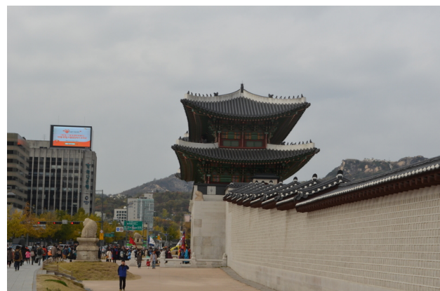
Figure 6.4 The Main Gate of the Kyŏngbok Palace, restored to its original position.