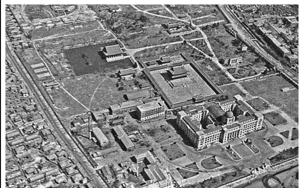
Figure 6.1 Former Japanese Government-General Building. 1954 from Ministry of

Although the Main Hall was among those structures that were preserved, it now found itself overshadowed by the five-storey, stone-built GGB. The colonial government later further encroached on the palace site by building the Japanese governor-general’s residence behind the Main Hall in 1939. As a result, the Main Hall was sandwiched between two modern-style Japanese buildings. These sites were believed to be especially ‘auspicious’, located along the ‘geomantic vein of vital energy’. When the two buildings were deliberately built in front of and behind the Main Hall, they seemed to signify the bleak future of Korea in geomantic terms: ‘the Korean palace was now starved of vital energy’ and its ‘geomantic fortune was all in the hands of the Japanese’ (Yoon 2006: 292). The ensuing city plan of the colonial government was an exercise in iconographic politics aimed at further distorting the geomantic balance between the city and nature by erecting a Shinto shrine at the southern end of the north-south axis. The north-south axis was soon developed as a main road, leading directly to the Japanese military base in Yongsan, beyond the city’s South Gate (Chung 1994: 52–54).